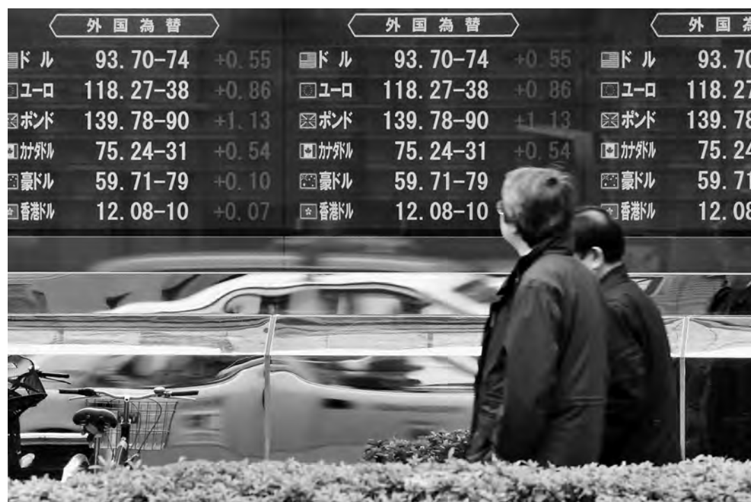
Ups and downs: People walk past a Tokyo brokerage's indicator board showing foreign currency exchange rates against the yen Dec. 2.

Dumped on the seat of their pants by what some pundits consider was an economic sucker punch, Americans have got to their feet and are facing up to their problems, swiftly reviewing and reassessing their entire financial system. That's a healthy attitude. But the magnitude of the problem is such that no coun-