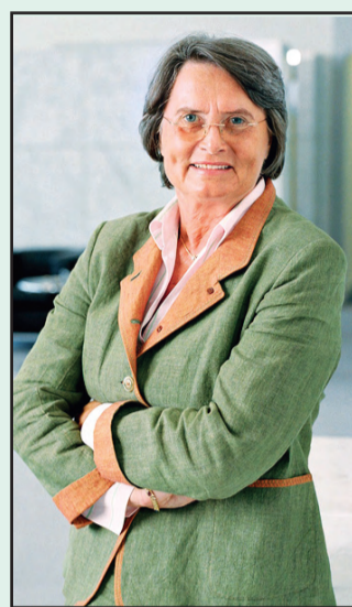
North Rhine-Westphalia Minister of Economic Affairs and Energy Christa Thoben

sities and technical institutions have stepped up their research in "greener" energy technology for power stations and energy grids, as well as in increased uses of hydrogen.