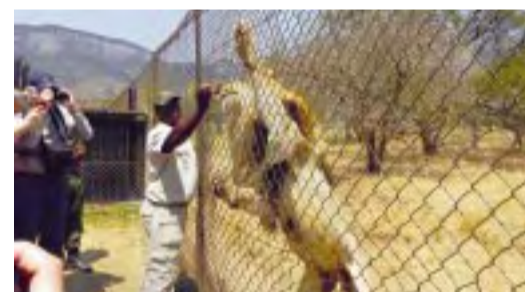
A lion gets friendly with a Moholoholo Rehabilitation Center staff member.