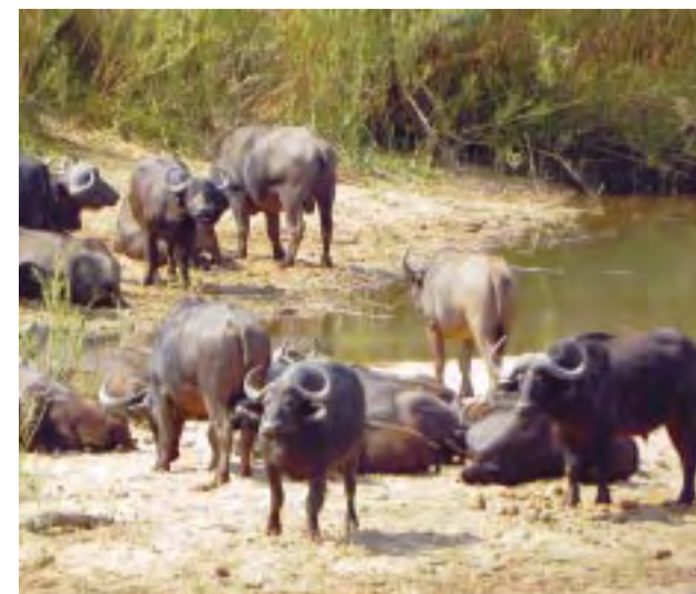
A herd of buffaloes sunbathes alongside a river.