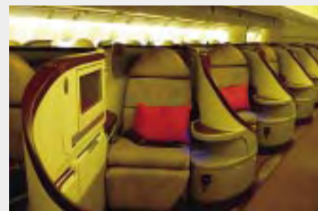
Thai Airways International's new lie-flat shell seats in Royal Silk business class

From Nov. 1, THAI will start operating daily flights between Haneda and Bangkok using Airbus A340-500 aircraft. Passengers flying between the Tokyo area and Bangkok will now have 4 flights per day (three from Narita) to choose from, allowing for a more convenient travel schedule. The fare for the Haneda-Bangkok round trip is from ¥130,000 for Royal Silk business class and from ¥40,000 for economy class (subject to conditions). For more details, please visit THAI's website at www.thaiairways.com