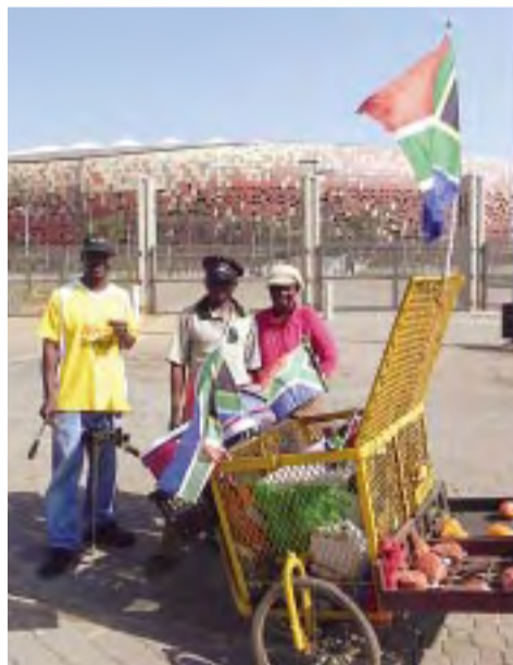
Locals, such as these vendors in front of Soccer City Stadium in Johannesburg, are notably friendly and welcoming to tourists.