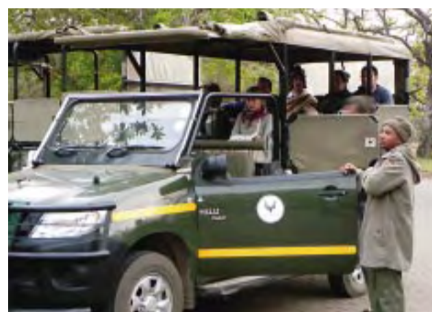
Visitors guided by an experienced ranger in a four-wheel drive, open vehicle prepare to see some wild animals.