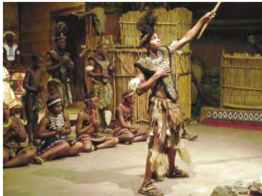
Tours at the Lesedi Cultural Village conclude with a powerful and mesmerizing tribal dance performance.