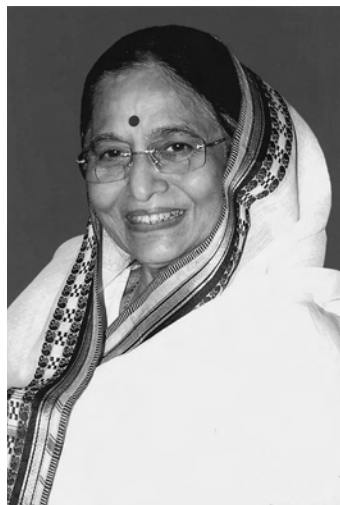
Indian President Pratibha Devisingh Patil

percent during the past five years, driven mainly by domestic investment and demand, has enabled India to improve the lives of millions of its citizens. India is today infused with the optimism