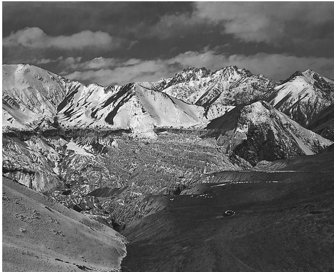
On top of the world: The Indian Himalayas make up some 70 percent of the majestic Himalayan Mountains.

I send my best wishes to the people of India for their further prosperity and for the continued development of our cordial relationship.