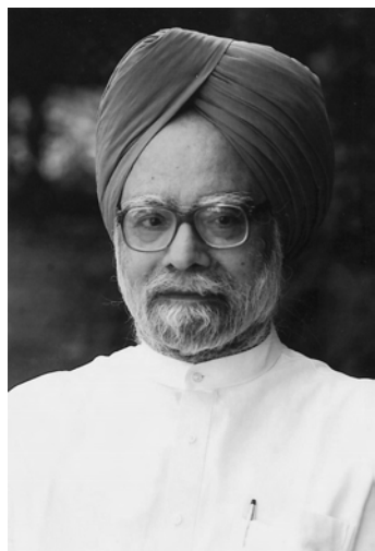
Indian Prime Minister Dr. Manmohan Singh