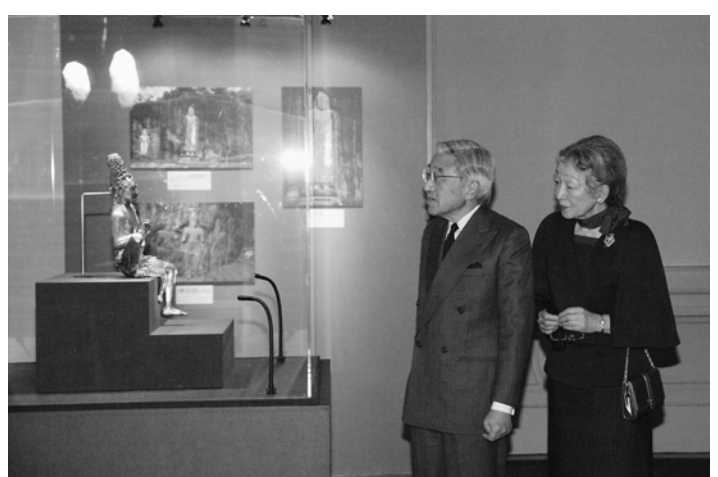
Distinguished guests: Emperor Akihito and Empress Michiko (above) admire some of the artifacts at the Sri Lanka Cultural Heritage Exhibition at the Tokyo National Museum in November. (Below) Former Prime Minister Yasuo Fukuda and his wife (below) visit the exhibition.

I take this opportunity to wish the government and people of Sri Lanka peace and prosperity, and promise to work toward sustaining our warm friendly relations.