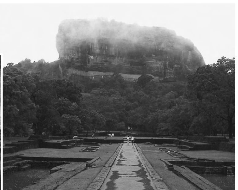
Rock of ages: Famed fifth-century frescoes and water gardens adorn the Sigiriya World Heritage site.

The 480.9 million Sri Lankan rupees cost of the project is being met by a grant from the government of Japan. The museum will open in April.