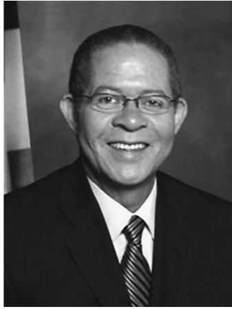
Prime Minister of Jamaica Orette Bruce Golding

Enhancing business climate The government is seeking ways of boosting private-sector development and strengthening competitiveness. An enabling environment is vital to support private investment-led growth. Therefore steps are being taken to simplify investment procedures, including those related to land purchases, and streamline regulatory requirements. A soft loan was agreed with the Inter-American Development Bank as part of a project to enhance competitiveness in Jamaica. In addition, the European Union has provided funding under its budget support program to reduce bureaucratic red tape and enhance the business climate. Efforts to rebuild the foundations for growth and competitiveness