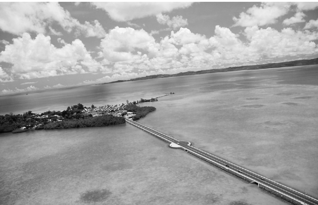
Island hopping: The Koror-Meyuns Causeway SIM ADELBAI