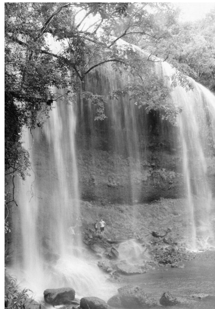
Ngardmau Falls: At 37 meters wide and cascading 30 meters down, the waterfall is the largest in Micronesia.