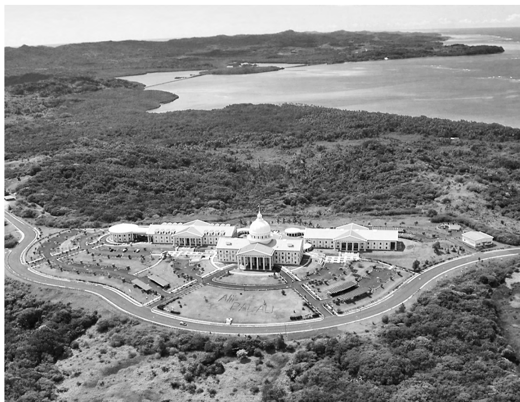
Seat of government: An aerial view of the Palau Capitol complex