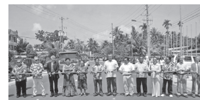
The project for the rehabilitation of arterial roads in the metropolitan area