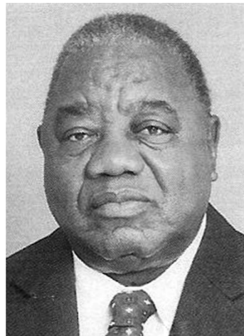
President Rupiah Banda

Generally, Zambia's economic fundamentals are encouraging and these are being propelled by my country's free market economy policies, where trade, interest and exchange rates are fully liberalized. Zambia has been undergoing considerable economic reforms to create a macroeco-