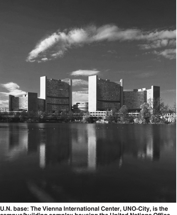
campus/building complex housing the United Nations Office in Vienna (UNOV).