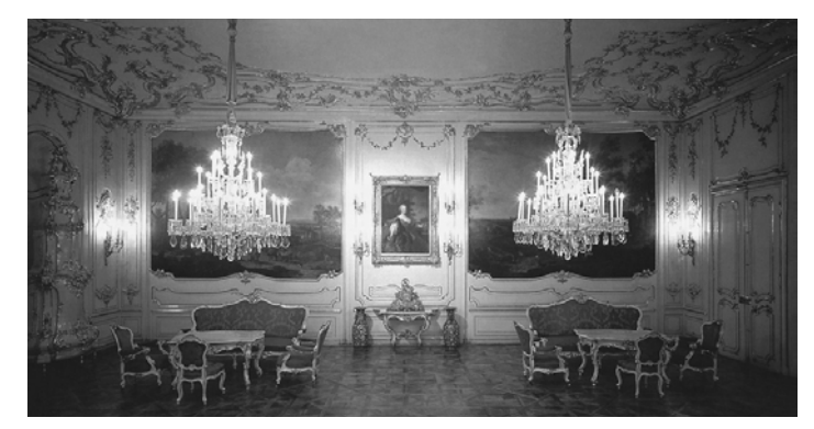
Schoenbrunn Palace: A former imperial summer residence. the Vienna palace and gardens illustrate the tastes, interests and aspirations of successive Habsburg monarchs.

2009 is also an anniversary for Austrian Airlines, which has offered nonstop flights between Vienna and Tokyo for 20 years. Therefore, I would like to take this opportunity to express my hope that the readers of The Japan Times will follow the example of the large number of Japanese tourists that visit Austria every year and enjoy the many different features of my country. You are most heartily welcome.