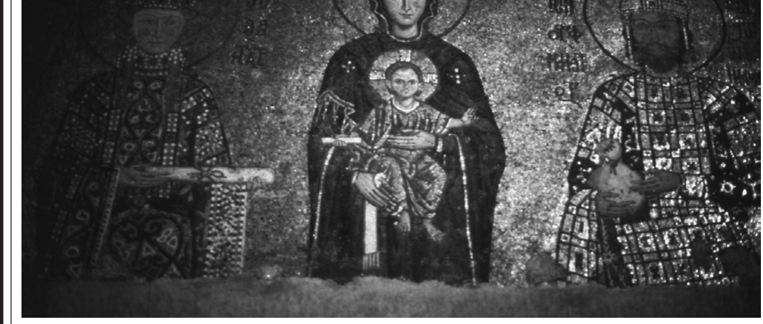
Religious masterpieces: The walls and vaults of Istanbul's St. Sophia are decorated with Byzantine mosaics.

Toyosu IHI Building 1-1, Toyosu 3-chome, Koto-ku, Tokyo 135-8710, Japan Tel: 03-6204-7250 Fax: 03-6204-8672