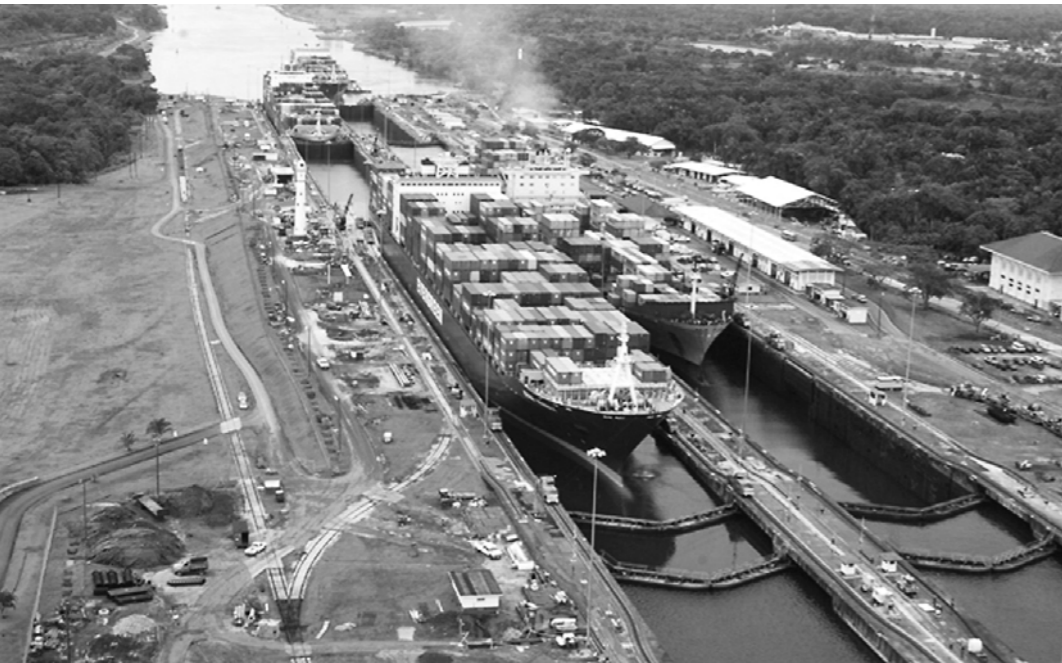
Key waterway: An estimated 14,000 ships pass through the Panama Canal each year.

I would like to reaffirm the will of the Martinelli administration to continue working together with the Japanese government to advance the common values of democracy, market economy and social development to further improve the well-being of our countries.