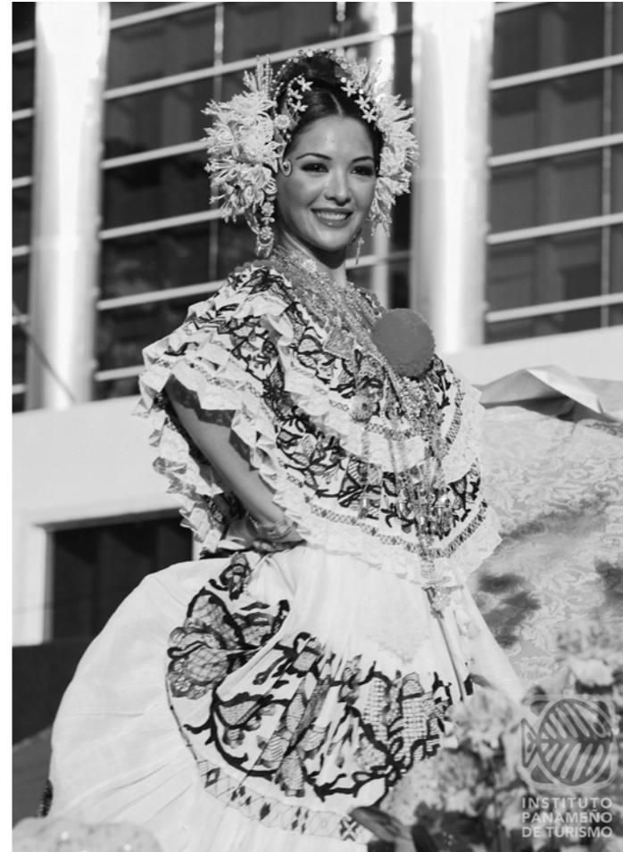
National dress: The flowing skirt, abundance of handwork and ornate jewelry make La Pollera one of the most beautiful costumes in the world. EMBASSY OF THE REPUBLIC OF PANAMA