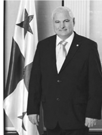
President Ricardo Martinelli Berrocal

As for public safety, the Martinelli administration managed to increase the sala-