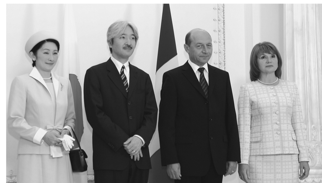
Golden year: Prince and Princess Akishino call on Romanian President Traian Basescu and his wife, Maria, during their visit to Romania in May 2009 in celebration of the 50th anniversary of the resumption of Romanian-Japanese relations.

Tourism is another field we would like to promote. Romania benefits from a great natural diversity and numerous UNESCO World Heritage sites. I would like Japanese tourism companies and Japa-