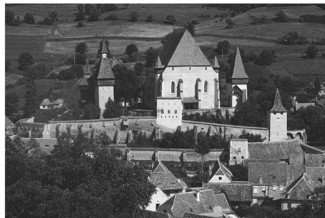
Nature, history: UNESCO World Heritage sites in Romania include Biertan village in Transylvania, with its fortified church built in the Middle Ages (above), and the Danube delta (left), the second-largest in Europe and one of the best-preserved, where some 300 species of birds live.