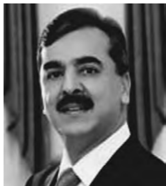
Prime Minister of Pakistan Yousuf Raza Gilani

Ever since the establishment of diplomatic relations between Pakistan and Japan on April 28, 1952, the two countries have enjoyed very cordial relations. They have always demonstrated mutual trust and propitious respect for each other's concerns and interests. This has helped evolve Pakistan-Japan friendship into a dependable partnership. Japan's economic assistance has played a very important role in the