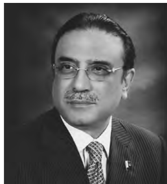
President of Pakistan Asif Ali Zardari

To commemorate that historic occasion, I express, on my own behalf and on behalf of my compatriots in Japan, our respectful and sincerest greetings to Their Majesties the Emperor Akihito and the Empress Michiko and the government and the people of Japan.