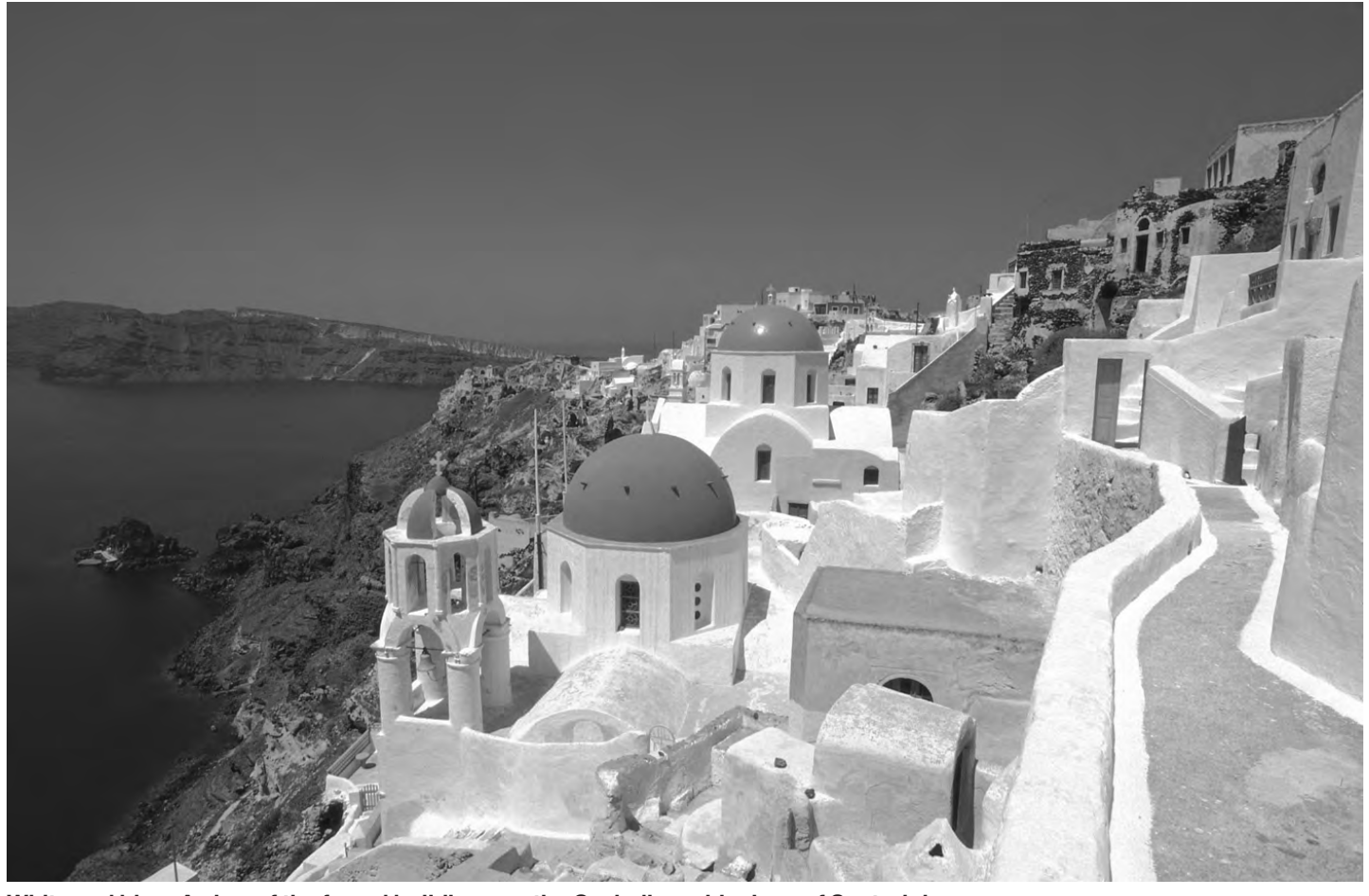
White and blue: A view of the famed buildings on the Cycladic archipelago of Santorini. EMBASSY OF GREECE

common architectural, artistic and even political brilliances that stem from the past. On the foot of the Parthenon the Japanese guest will see the new Acropolis Museum, the proof of the coexistence of past and present, harmoniously cohabitating, which is an absolute must in the beginning of