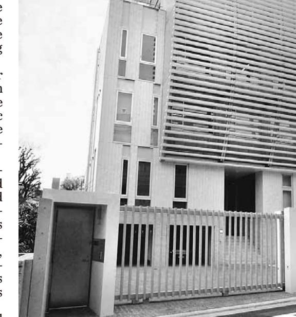
Inauguration: Papua New Guinea's new embassy building in Tokyo officially opens March 31.

Being the second chancellery to be constructed in Papua New Guinea's history further underlines the significance of the relationship with Japan