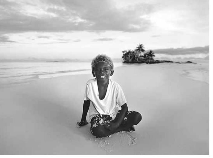
Human touch: Beyond the many activities available in Papua New Guinea — diving, surfing, fishing, trekking and bird watching — and cultural aspects, the most impressive for tourists will be the hospitality of the friendly local people and the children's smiles.

The PNG LNG Project is an integrated development that are now complete and its affilincludes gas production and iate, Esso Highlands Ltd., is CONTINUED ON PAGE 7