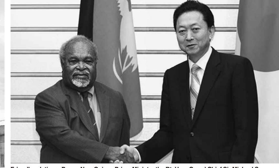
Friendly relations: Papua New Guinea Prime Minister the Rt. Hon. Grand Chief Sir Michael Somare meets Prime Minister Yukio Hatoyama in Tokyo on March 29. CABINET PUBLIC RELATIONS OFFICE

We at Air Niugini will build an important bridge between Japan and Papua New Guinea, and South Pacific island states, and very much look forward to serving you on our flights.