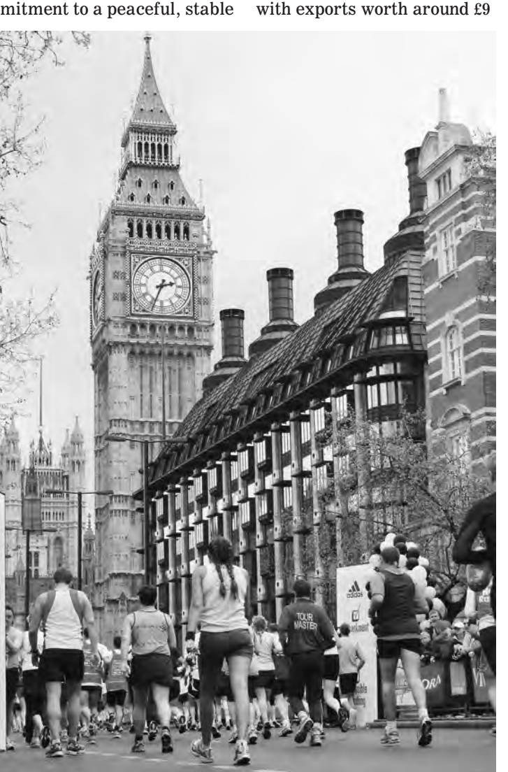
Impressive: With the 2012 Games, London will be the first city to host the modern Olympics three times. BRITISH EMBASSY