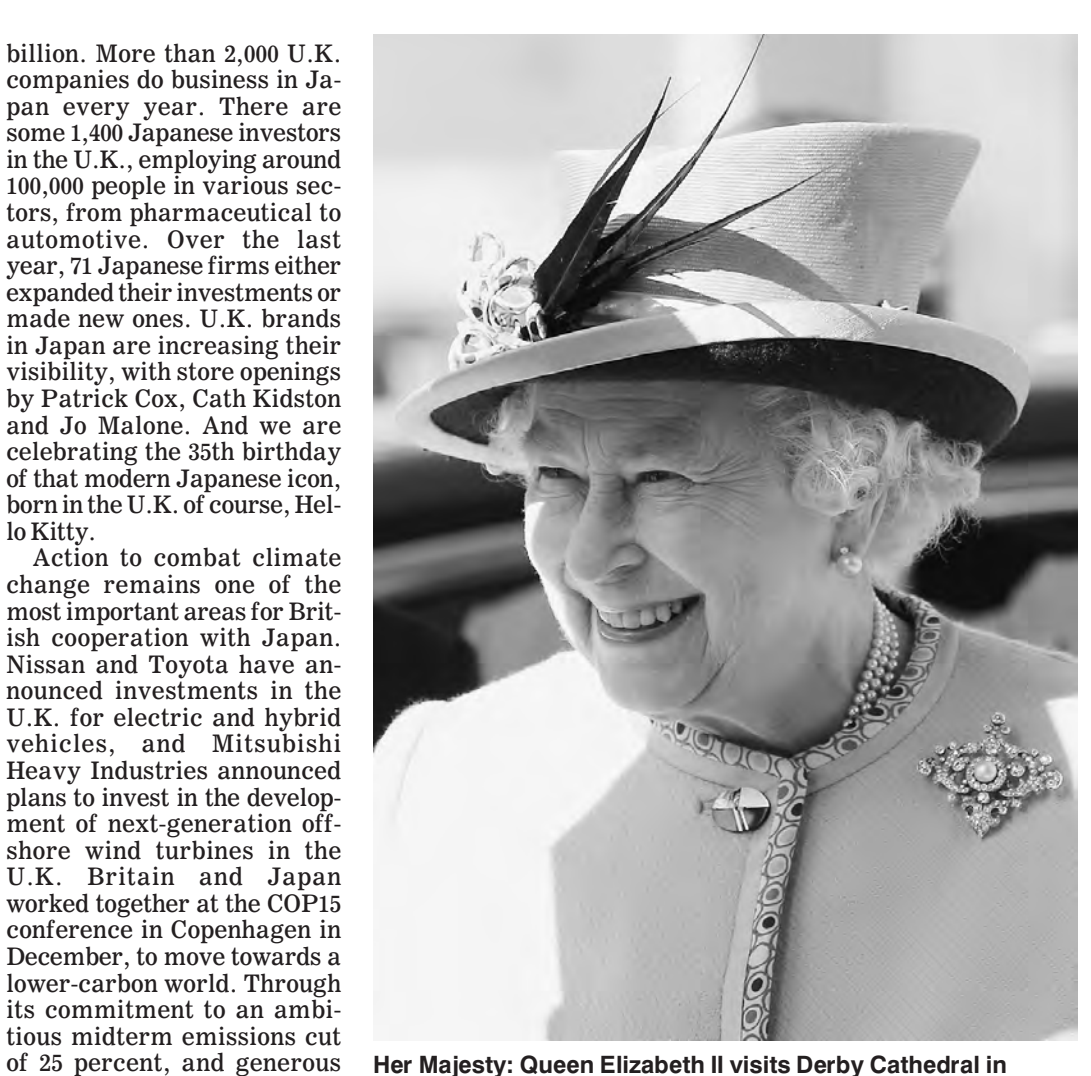
Her Majesty: Queen Elizabeth II visits Derby Cathedral in England on April 1 to continue the Holy Week tradition of distributing "Maundy money" to deserving subjects.

duced the embassy's carbon footprint by 11 percent, and our fuel consumption by about 20 percent, compared to last vear. We have been surprised at how much we have been able to reduce our emissions just by taking a few simple steps. It shows how much we can all do if we work together.