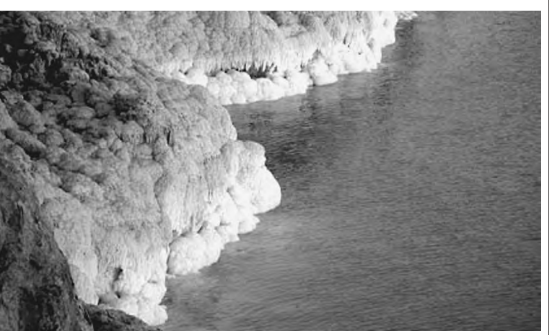
Nature's wonder: Fed by the Jordan River, the Dead Sea has a high salt concentration, as these salt crystals along the coastline reveal.