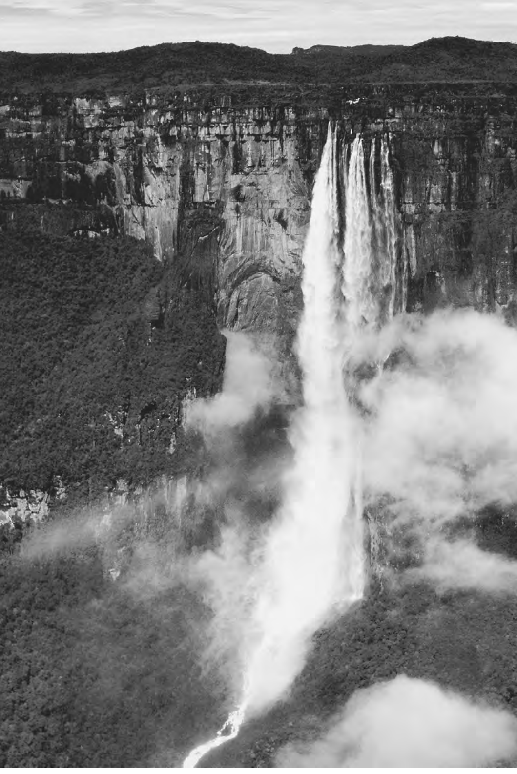
Incredible height: Angel Falls in Canaima National Park, a UNESCO World Heritage site, is the

On this auspicious occasion of the anniversary of the nation's independence, I wish Venezuela and its people