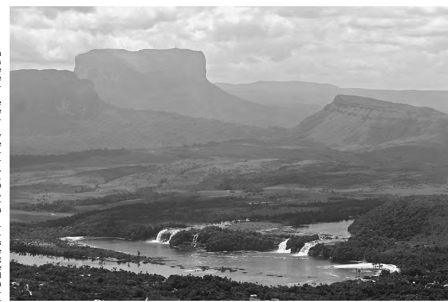
Natural wonder: Canaima National Park is well-known for its flat-topped mountain formations known as "tepui," which comes

Japan's national soccer team, Samurai Blue, performed well above expectations during this World Cup and garnered the respect of fans and admirers from every part of the globe, including those in our country. Yet, Japan resembles Venezuela in the same passion we have for baseball. In the 2010 season, a record 58 Venezuelans joined the rosters of MLB teams, second only to the Dominican Republic in terms of foreign-born players in U.S. professional baseball. In Japan, along the