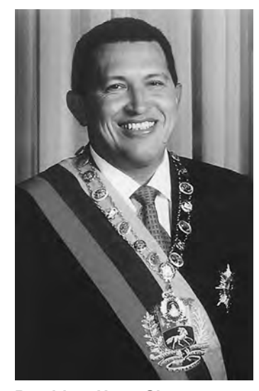
President Hugo Chavez

consolidation of achievements as a result of continuous social investment made by the government of President Hugo Chavez: