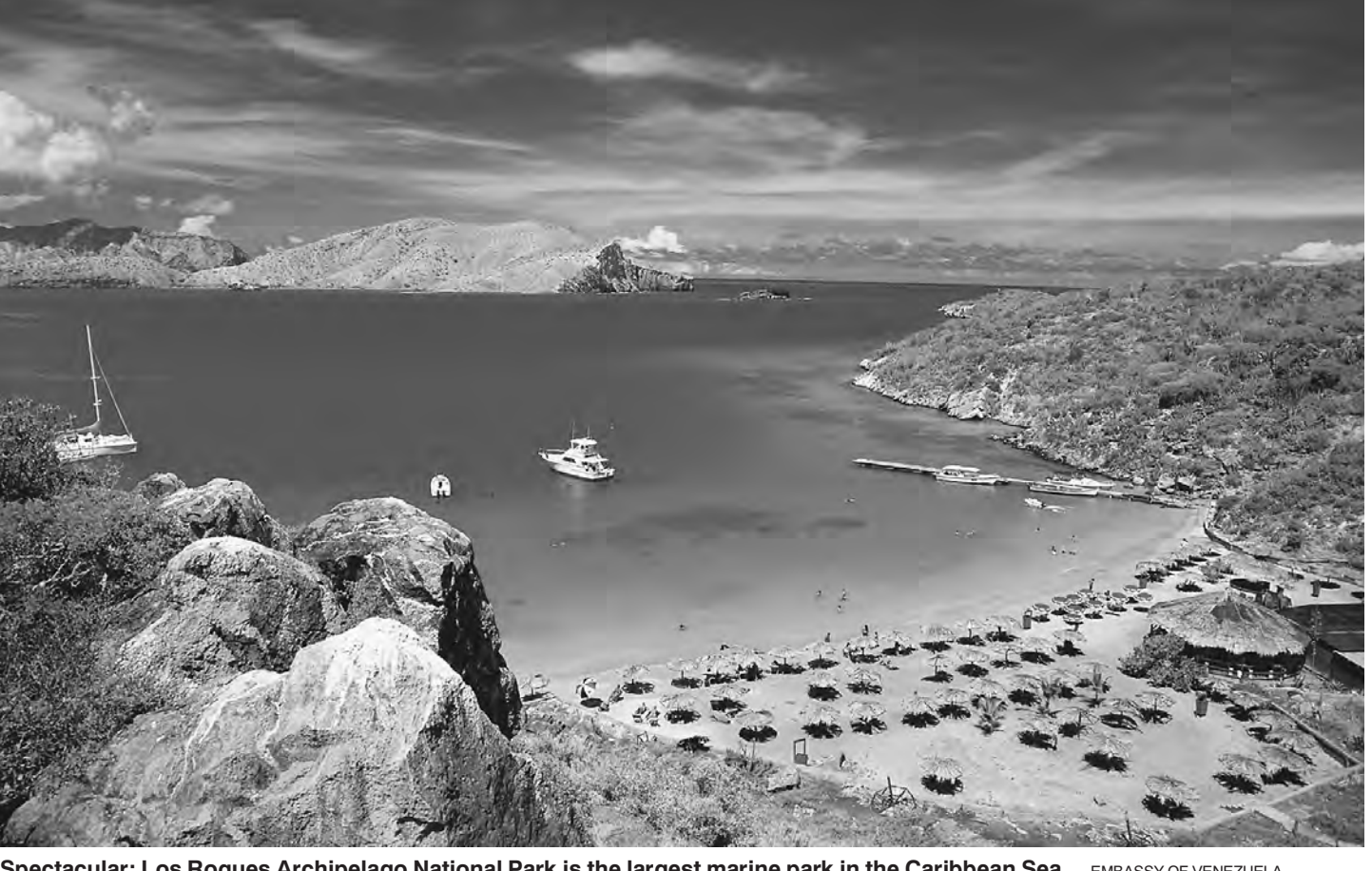
Spectacular: Los Roques Archipelago National Park is the largest marine park in the Caribbean Sea.

Finally, I would like to reiterate our warmest felicita tions on this historic day and to assure all our Venezuelan friends that the Japan-Venezuela Association will continue to contribute to the strengthening of our bilateral relationship.