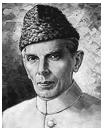
Quaid-i-Azam Muhammad Ali Jinnah, the founder of Pakistan

day's Pakistan. The archaeological and cultural remains from Moenjodaro, Harrapa and Taxila testify to the acumen and wisdom of inhabitants of this land. The Indus Valley civilization that existed between the Indus and Oxus rivers is one of the oldest civilizations in the world. The great Buddhist civilization began its outward journey from Pakistan. Many renowned emissaries who went to China and later to Japan and other countries carrying the teachings of the Buddha were graduates of Taxila University. The ancient heritage provides a historical underpinning to