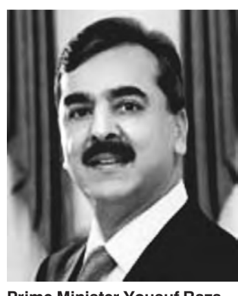
Prime Minister Yousuf Raza Gilani

presented by our national poet Allama Muhammad Iqbal in 1940 was transformed into reality. Despite all the predictions at its birth that the newly independent state of Pakistan would soon collapse, Pakistan and its people have withstood the test of time. No other state in the world has been confronted with as many challenges as Pakistan has during its 63 years of history, yet its resilient, hardworking and dedicated people have risen up to all the challenges.