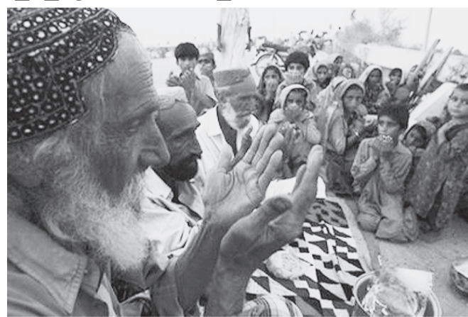
Displaced Pakistan flood victims pray for help.

Let's pledge to help our flood-affected brothers and sisters back home. At Pak Japan we are doing our best for the motherland.