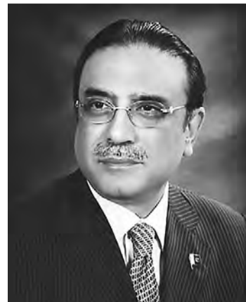
President Asif Ali Zardari

The emergence of Pakistan as a sovereign state on Aug. 14, 1947, was the result of a long unabated struggle of the Muslims of South Asia to create a homeland where they could lead their lives according to their aspirations of peace, prosperity, religious freedom and brotherhood — the ideals of Islam. Under the great leadership of Quaid-i-Azam Muhammad Ali Jinnah, within a short span of seven years, the idea of Pakistan