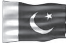
دل دل پاکستان