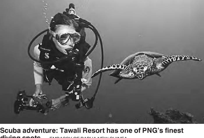
diving spots. EMBASSY OF PAPUA NEW GUINEA Diverse heritage sets nation apart

organization, as a nongovernmental organization, can continue to play its part to promote the people-to-people, mutual understanding in the