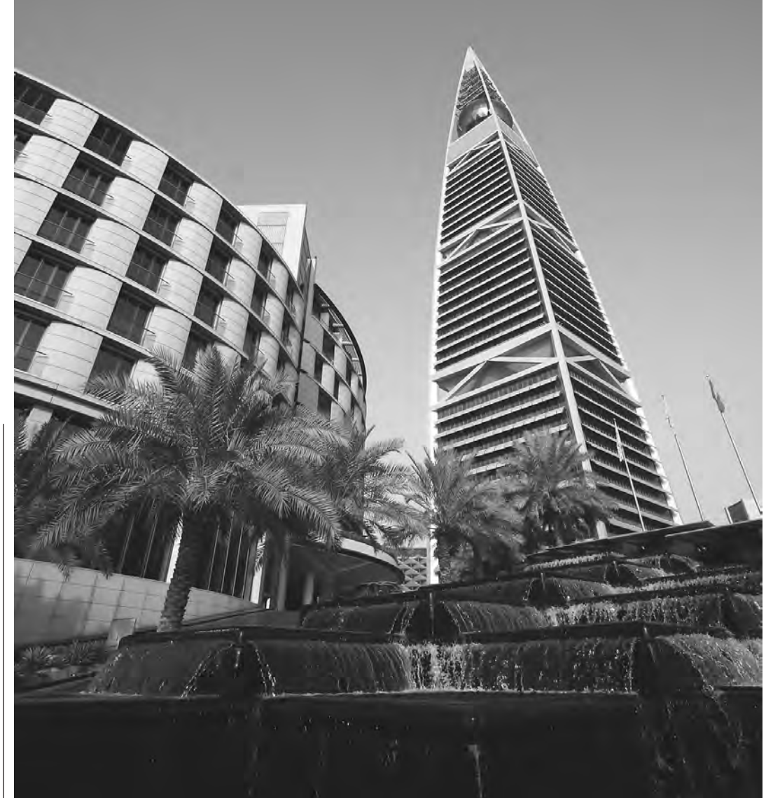
Riyadh icon: Al-Faisaliah Tower was the first of the startling new structures to rise above the Saudi Arabian capital's skyline. The building includes a five-star hotel, four exclusive restaurants, a shopping mall, offices and apartments. The needle point pinnacle is 267 meters above the ground. EMBASSY OF SAUDI ARABIA

Congratulations on the National Day and our best wishes for the continued peace and prosperity of the Kingdom of Saudi Arabia.