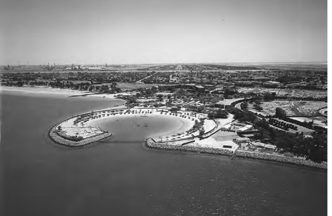
Growth spurt: The former fishing town of Al-Jubail, backed by billions of dollars in investment, is the largest ongoing civil engineering project in the world.

Congratulations to the People of The Kingdom of Saudi Arabia on the Occasion of the 80th Anniversary of Their National Day