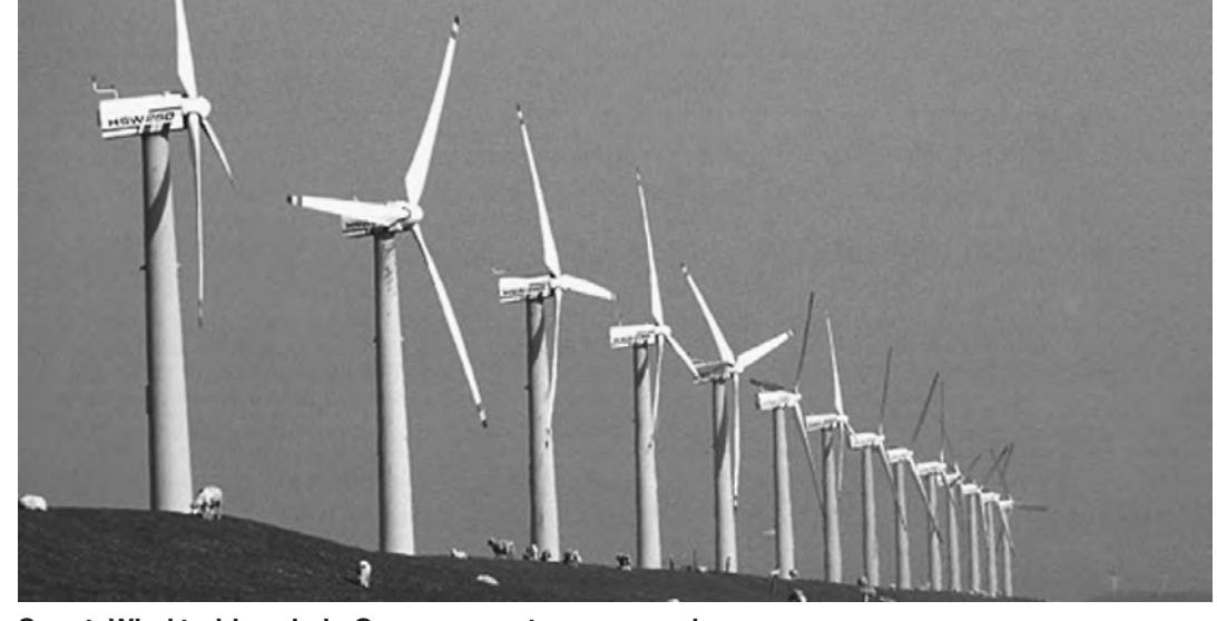
ever. This is the aim of the new Smart: Wind turbines help Germany meet energy needs. GERMAN INDUSTRY AND COMMERCE

Meanwhile, former pieces of the Wall, massive symbols of division and lack of freedom, are treated as pieces of art, to be found in public CONTINUED ON PAGE 7