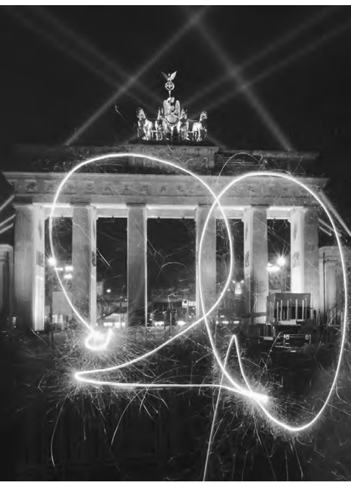
Time to remember: An image commemorates 20 years since the fall of the Berlin Wall.

日独交流150周年 Jahre Freundschaft Deutschland-Japan