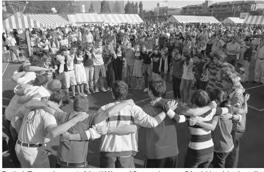
Festival: The opening event of the 150 Years of German-Japanese Friendship celebration will take place at the German School of Tokyo Yokohama on Oct. 16.

Our joint efforts will help to acknowledge what has been achieved in both countries and at the same time, to show the exciting opportunities for cooperation that lie ahead of us. Come and join in!