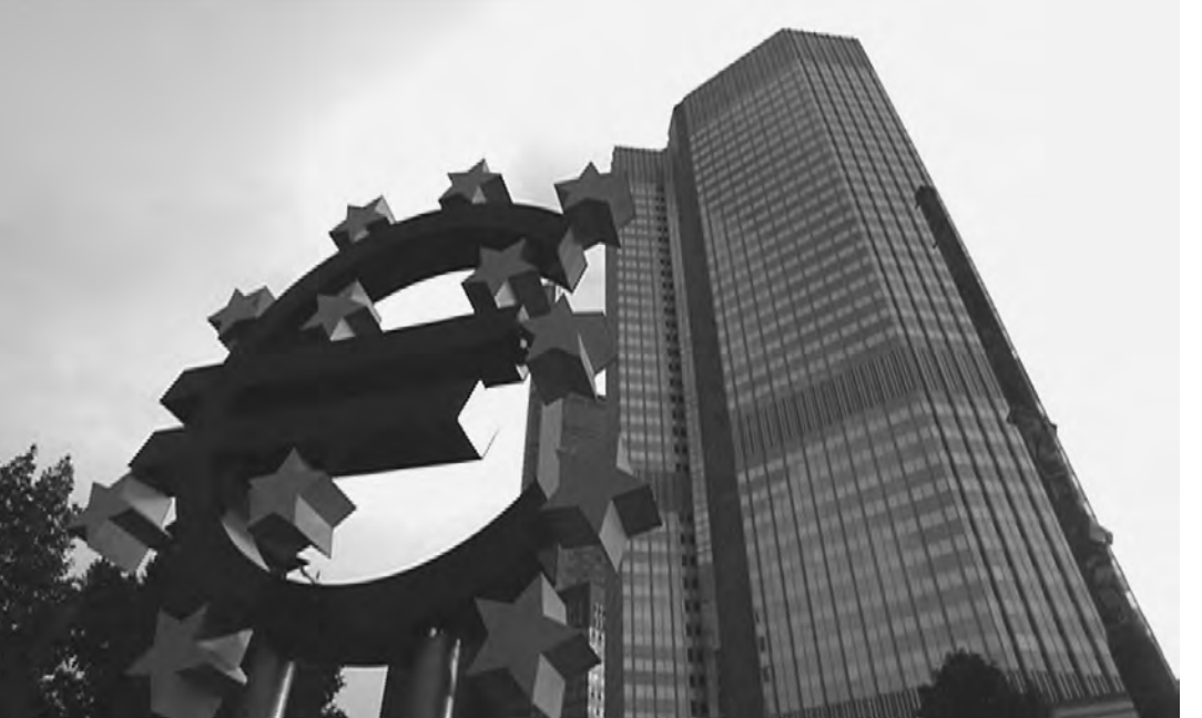
Euro mark: The European Central Bank, which administers the monetary policy of the countries that use the euro, is headquartered in Frankfurt.

Japan and the Japanese people have been staunch supporters and close friends of Germany throughout the postwar period. Japan's support for German unification was unwavering. When the grand goal was achieved 20 years ago, the Japanese people celebrated with us, and their joy was spontaneous and authentic. In its year of coming of age, unified Germany is therefore all the more keenly looking forward to the opportunity of a series of German-Japanese events where joint achievements can be celebrated and future initiatives designed.