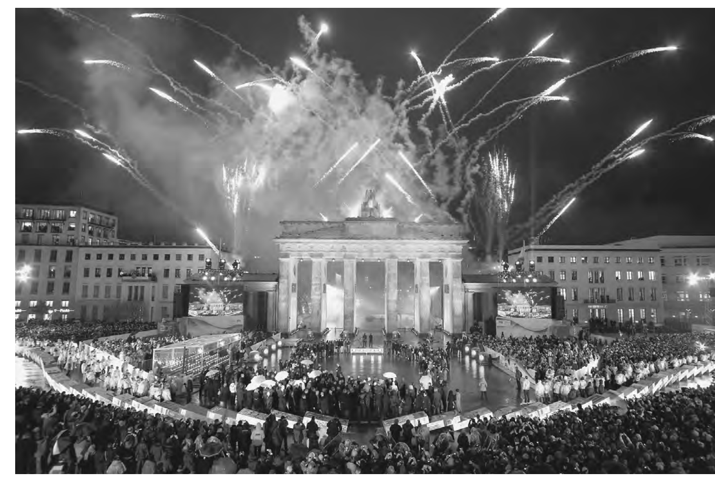
Two decades: A ceremony on Nov. 9, 2009, in front of Brandenburg Gate celebrates 20 years since the fall of the Berlin Wall.

In a rapidly globalizing world, the opportunities that Germany has to pursue as well as the challenges it has to tackle go beyond the boundaries of Europe. In this respect, the instances in which German concerns coincide with Japanese ones are fast increasing in number. We have experienced this in our common fight against global warming, where we closely cooperated for the formulation of the Kyoto Protocol, and jointly tried to achieve more in Copenhagen — sadly, to no avail. We are equally committed to nuclear nonproliferation and disarmament. Germany, welcoming the initiative of Japan and Australia for a Cross-Regional Group on