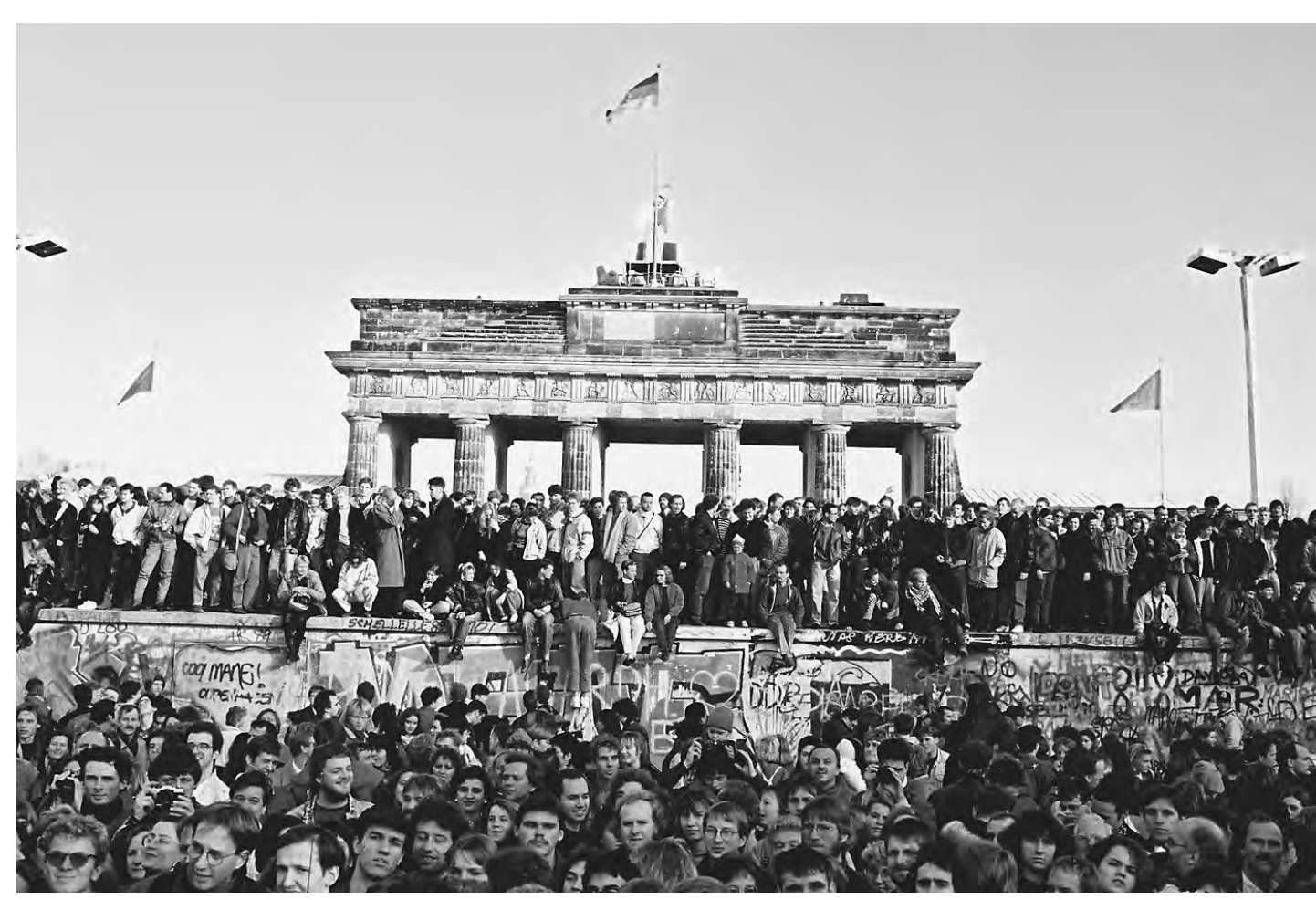
Irreversible: The fall of the Berlin Wall starts on Nov. 9, 1989, paving the way for German reunification.

As Japan and Germany celebrate 150 years of friendship, the similarities both countries share make them logical partners in solving many of the challenges of the future. If both countries combine their specific strengths, cooperation in the fields of mobility and smartenergy solutions can be key drivers for the deepening of their relations.