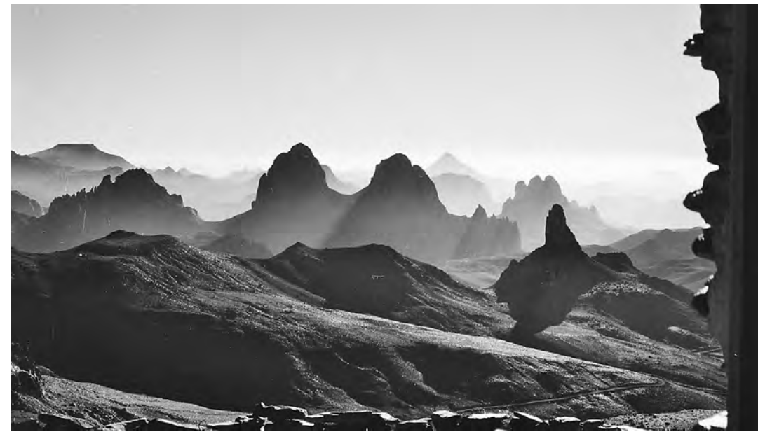
Forbidding: The Hoggar Mountains rear up out of their sweltering, sandy base in Algeria's southeast Sahara Desert region.

Finally, while celebrating Algeria's National Day, we are happy to see that ingredients do exist to make Algeria's relationship with Japan an exemplary one. We will certainly maintain our effort to realize this passionate and great goal. To conclude, I would like to renew the expression of our sincere respect and consideration for the great Japanese people, whose development achievements can be a source of inspiration not only for Algeria, but also, I am quite sure, many other peoples of the south.