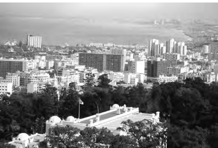
Seafont: Situated on the west side of a large bay of the Mediterranean Sea, the capital Algiers is the largest Algerian city.

On the occasion of Algeria's National Day, I would like to express my heartfelt wishes for Algeria's continued development and further prosperity.