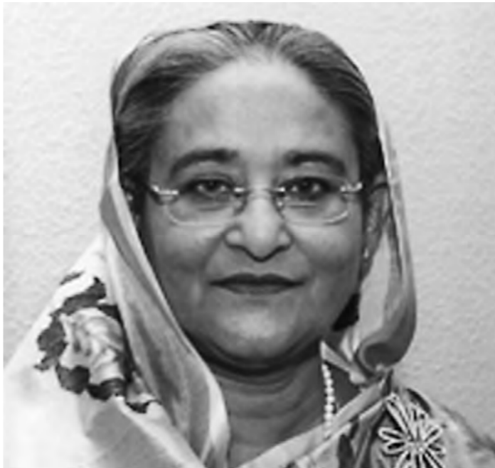
Prime Minister of Bangladesh Sheikh Hasina

She will also meet the Japan-Bangladesh Parliamentarians' League, attend a business seminar at Tokyo Kaikan and a Bangladesh community reception. The prime minister will also lay the foundation stone of the new embassy complex of Bangladesh. For Hasina, this trip marks her second visit to Japan as prime minister, following an official visit in 1997. During her stay in Japan, she will also visit Osaka and Hiroshima.