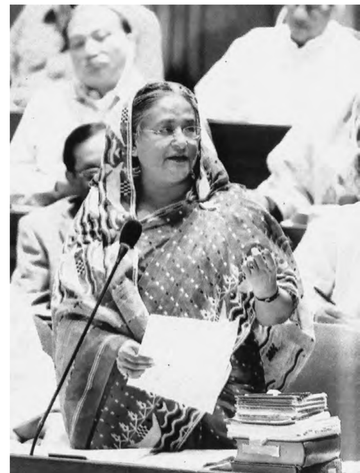
Leadership: Prime Minister Hasina speaks at the National Assembly building, Jatiyo Sangsad Bhaban, in June in Dhaka.