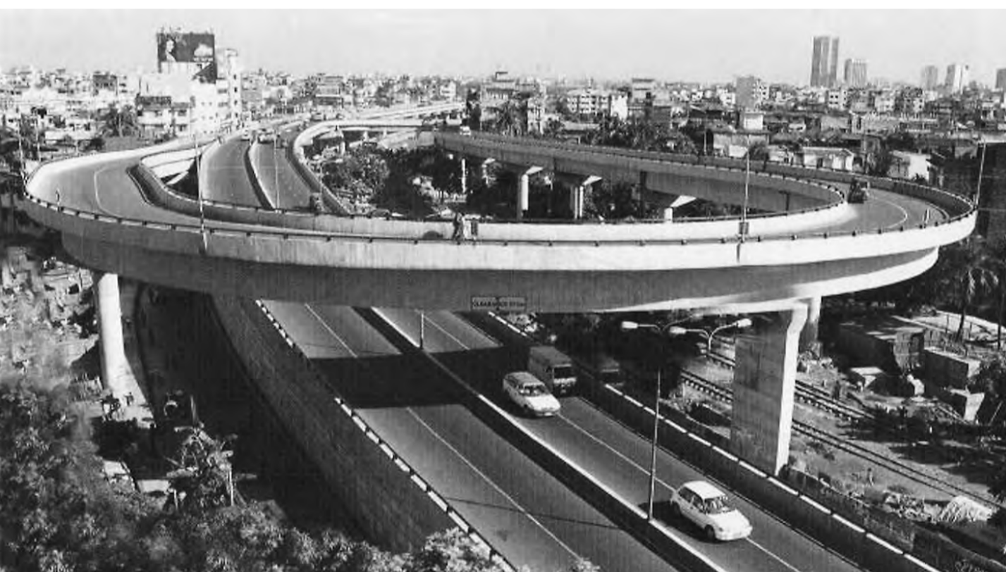
Modernity: This flyover in Dhaka shows the nation's modern infrastructure.

Information provided by the Embassy of Bangladesh.