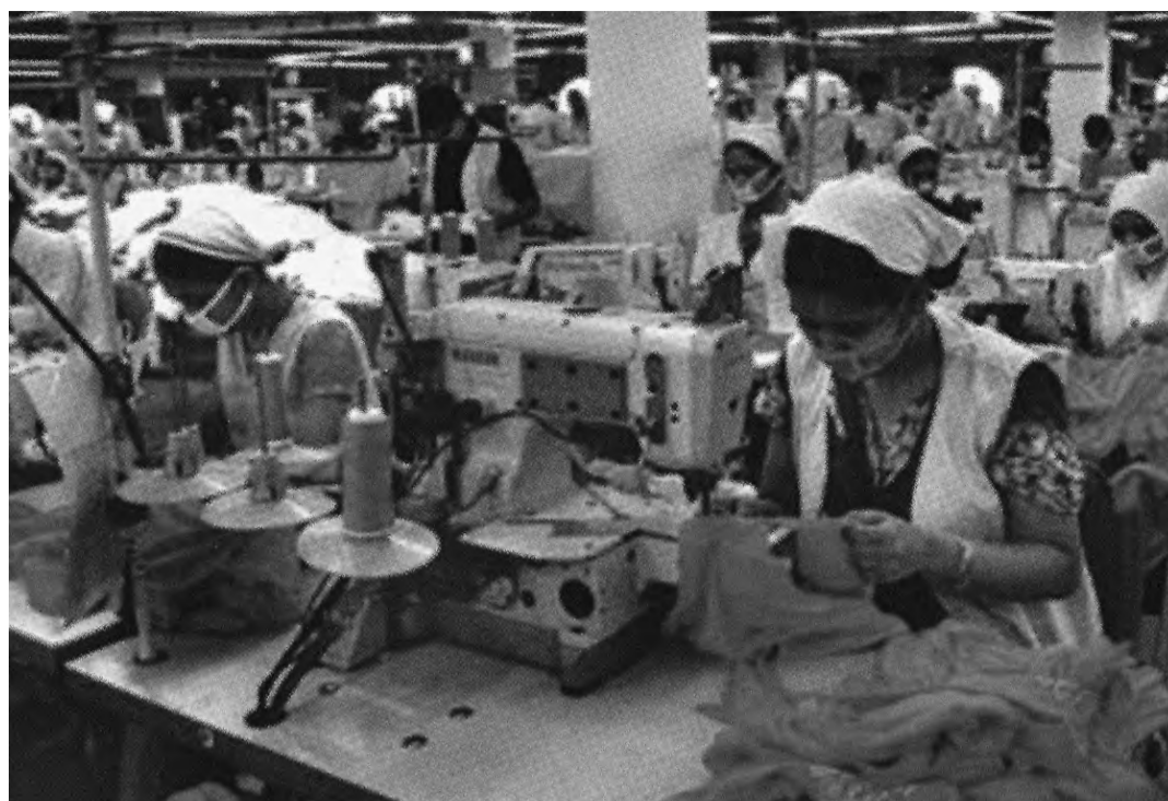
Manpower: An abundance of skilled labor is one of Bangladesh's advantages as a destination for investment from countries around the world. EMBASSY OF BANGLADESH

The Bangladesh Export Processing Zones Authority (BEPZA), the government organ responsible EPZs, has also accelerated the privatization effort of the government by successfully converting two state-owned enterprises of the country, namely Chitta-