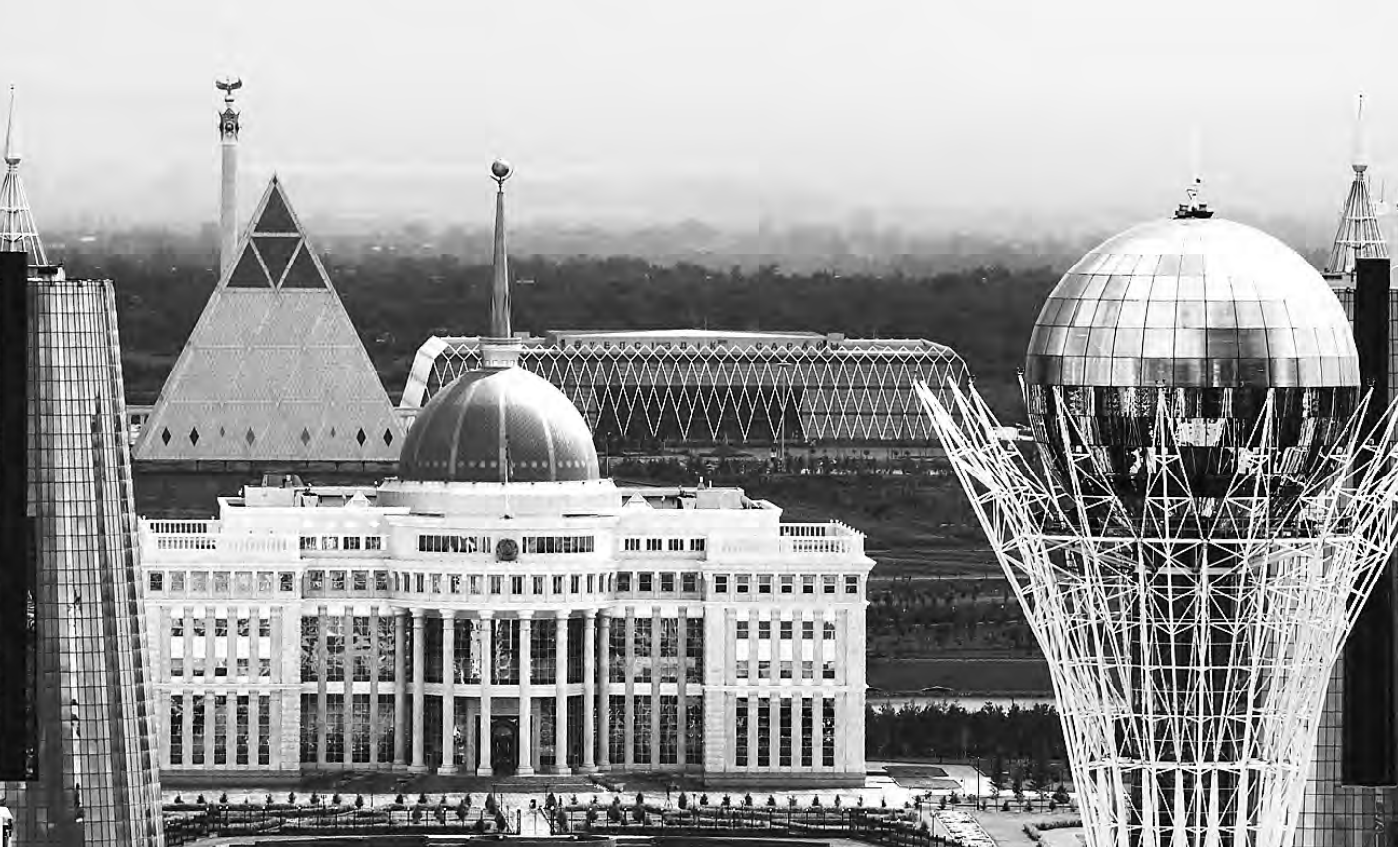
Heart of government: The administrative center of Astana City

The logical conclusion of our chairmanship was the OSCE Summit held in Astana on Dec. 1-2, which was at-tended by 73 official delega-