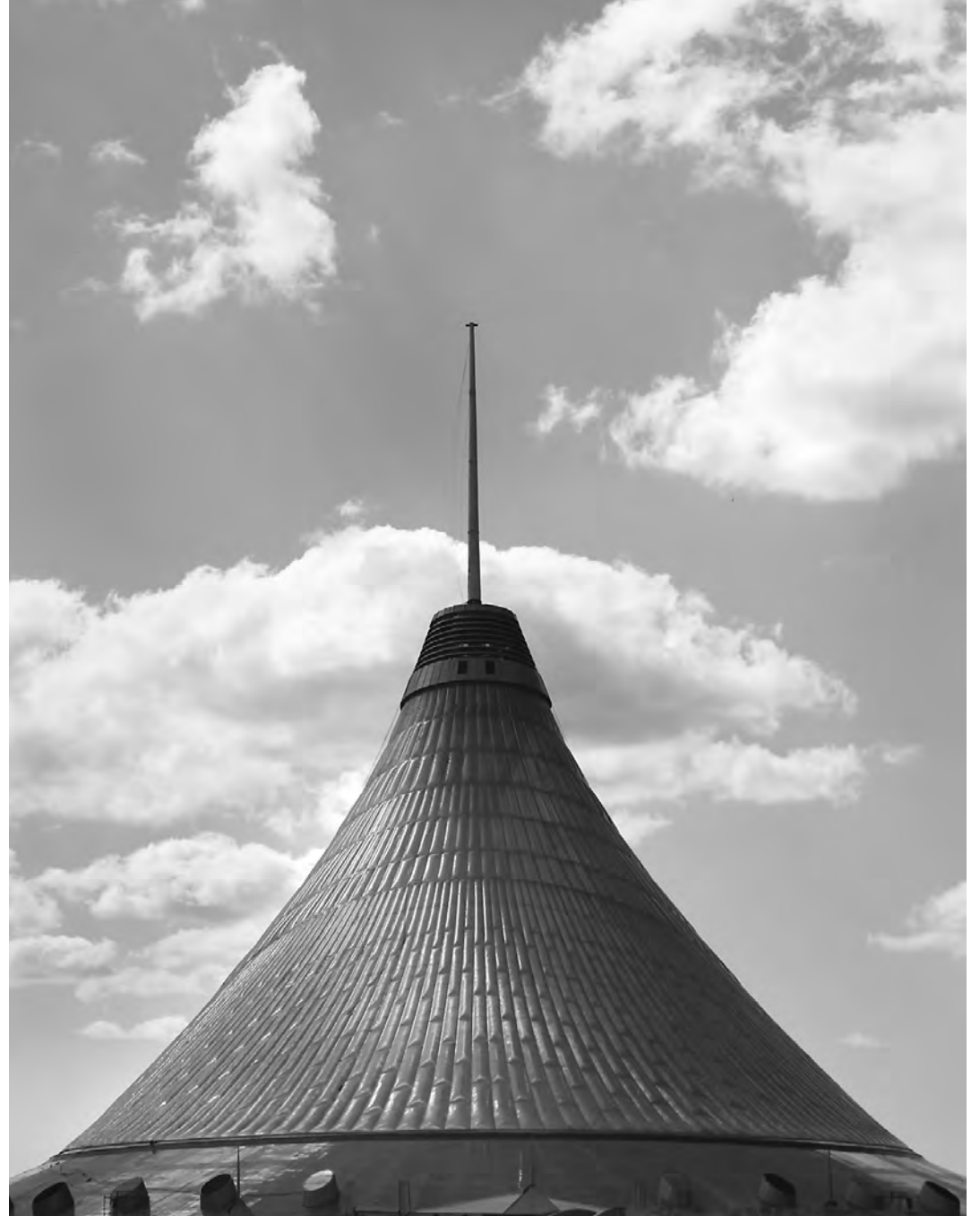
Futuristic: The Khan Shatyr Entertainment Center, designed by British architect Norman Foster and opened this July in Astana, has a 150-meter-high transparent tent over an area of 140,000 sq. meters — larger than 10 football stadiums.

'Today in Astana in the new historical conditions the spirit of Helsinki was revived. I am convinced that the Eurasian vector is able to give a powerful impetus to