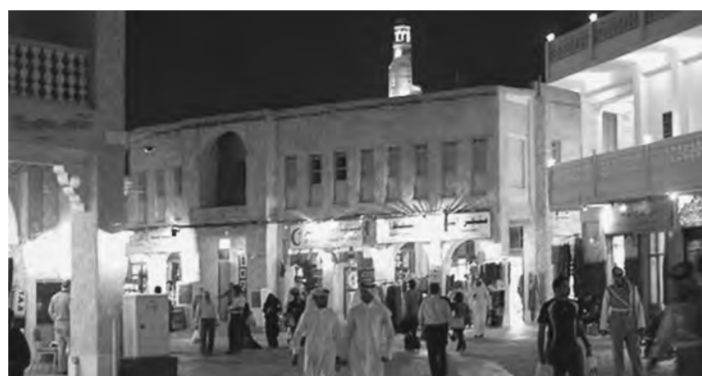
Traditional market: The newly restored Souq Waqif is one of the top tourist destinations in Doha.

I sincerely hope that Qatar will continue its prosperity and development under the superior leadership of the emir, and our mutual relationship will continue to develop.