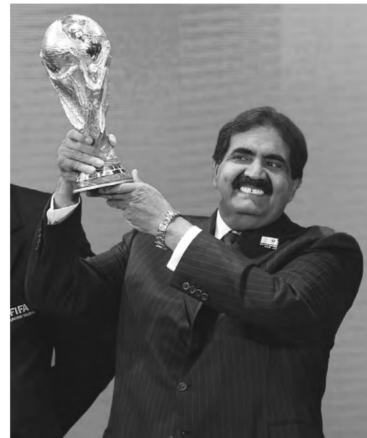
And the winner is: Emir of Qatar Sheikh Hamad Bin Khalifa Al-Thani holds the World Cup trophy (above) after the announcement Dec. 2 in Zurich, Switzerland, by FIFA President Sepp Blatter (left) that Qatar would host the 2022 soccer World Cup.