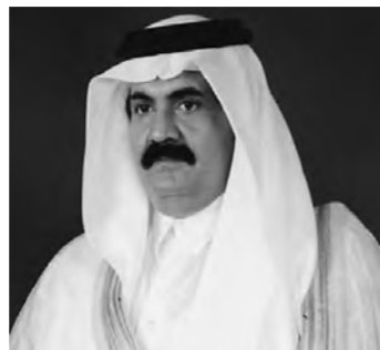
Emir of Qatar H.H. Sheikh Hamad Bin Khalifa Al-Thani

This historic accomplishment emphasizes the significant strides made by the State of Qatar in the economic, political and sports spheres to establish itself as a shining star in the sky of the region and the world. Organizing soccer's showpiece event for the first time in the Middle East will make Qatar a gate of hope for the region, which has long been suffering from chronic tensions, and burning with many crises and wars. Qatar sincerely hopes that this prestigious event will contribute to enhance the culture of peace in the region, and deepen understanding and interaction between the different cultures and civilizations. It is certain also that this opportunity will yield huge economic benefits for many countries throughout the region and will