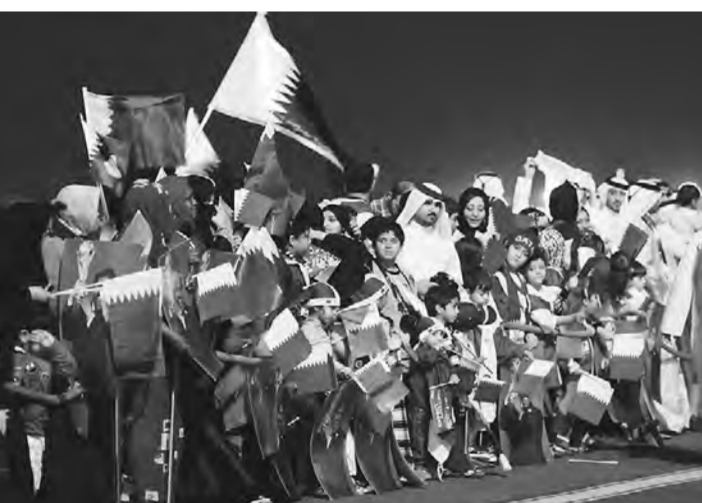
Dream come true: Qataris wave national flags as they celebrate in Doha on Dec. 3, the day after world soccer's governing body FIFA announced the Gulf city will host the 2022 World Cup.

After the World Cup ends, the new stadiums will be partially dismantled and their upper tiers will be sent to developing countries to build 22 stadiums in those countries that lack sufficient soccer infrastructure, thus allowing for the further development of the game on a global stage.