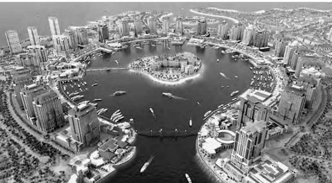
Island paradise: The Pearl Qatar is a phased mixed-use development comprising 10 distinct, themed districts that include beachfront villas, elegant town houses, luxury apartments, exclusive penthouses, five-star hotels, marinas, and upscale retail outlets and restaurants all situated on an artificial island encompassing 400 hectares of reclaimed land just off the coast of the Arabian Peninsula in the State of Qatar.

construction of nine new state-of-the-art stadiums with a modular design, in addition to renovation of three others, with a total cost estimated at around $3.5 billion. The 12 stadiums are divided among seven host cities all located within a 25- to 30-km radius, making it the most compact FIFA World Cup ever, easily and quickly accessible for the benefit of fans and teams.