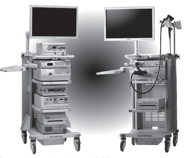
OLYMPUS MEDICAL SYSTEMS CORP. Shinjuku Monolith, 3-1 Nishi-Shinjuku 2-chome, Shinjuku-ku, Tokyo 163-0914, Japan www.olympus.com

Superior Endoscopic Video Imaging Technology