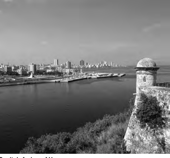
Capital: A view of Havana CUBAN EMBASSY