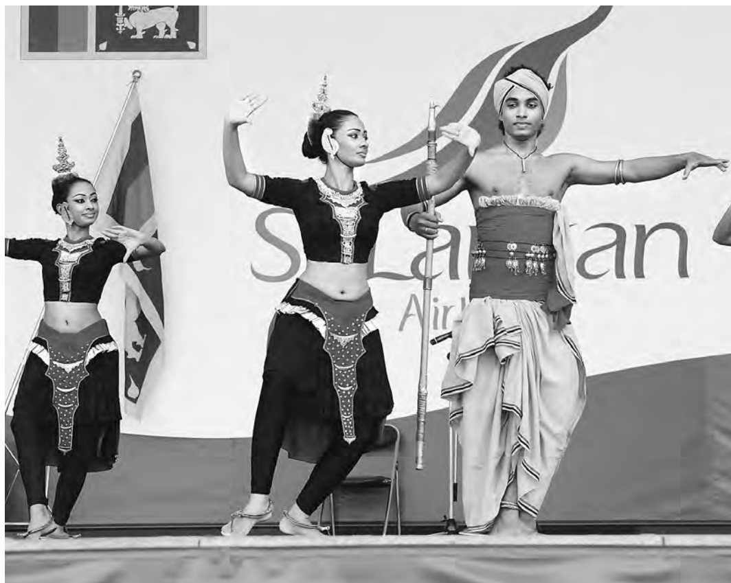
Cultural exchange: Dancers perform at the Seventh Sri Lanka Festival held at Yoyogi Park in Tokyo last September.

In closing, we trust that Sri Lanka's continuing policy of welcoming companies from overseas will sustain and enhance its remarkable progress. Going forward, the JSLBCC will continue to actively promote ever closer commercial ties between Japan and Sri Lanka.