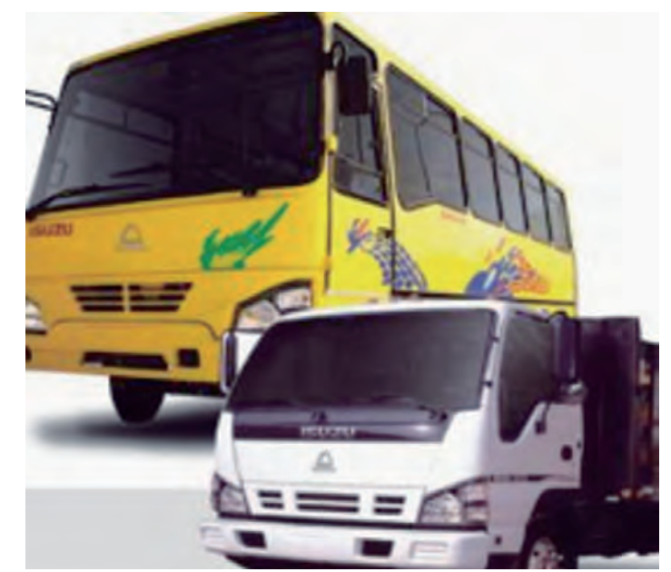
for the country.