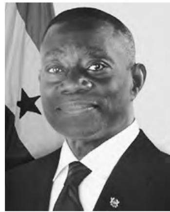
President of the Republic of Ghana John Evans Atta Mills

Ghana's renowned political stability apart, the nation has made significant strides in economic development. The implementation of sound policies have earned the country macroeconomic stability. The agricultural-sector-led strategy enshrined in the "Better Ghana" agenda of the government focuses on value addition through the processing of major export produce such as cocoa beans and coffee, and diversification toward nontraditional exports. This has expanded the scope of Ghana's exports, and created more employment and improved the livelihoods of 70 percent of the country's labor force.