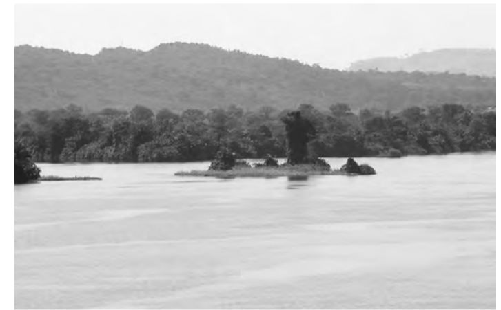
Water supply: Lake Volta is the largest reservoir by surface area in the world, created after the Akosombo Dam (left) was completed in 1965.