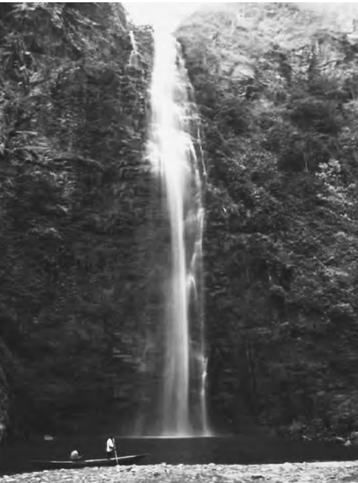
Natural splendor: Wli Falls, the highest waterfall in Ghana, is in the heart of a tropical forest.

It is my fervent hope that the coming years will witness the further expansion of the strong partnership and fruitful cooperation that characterizes the bilateral relations of our two countries.