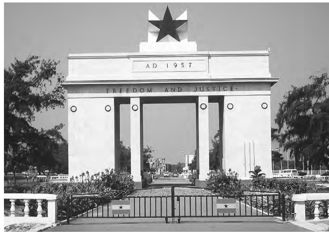
Capital landmark: The black star on the Independence Arch in Accra and on Ghana's flag symbolizes African freedom.

There was also agreement on further mutual support enjoyed by Japan and Ghana on many initiatives within the United Nations and other international forums, notably on such global issues as climate change, biodiversity and human rights. While Ghana pledged its support for Japan's bid for a permanent seat on the U.N. Security Council during the state visit of President Mills