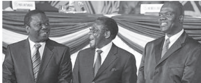
Leaders: President Robert Mugabe (center), Prime Minister Morgan Tsvangirai (left) and Deputy Prime Minister Arthur Mutambara make up the Inclusive Government of Zimbabwe.

Our country, of course, continues to navigate its way through difficult political and economic waters: the politics characterized still by unrelenting external interference in our affairs, and the economics complicated by a range of declared and undeclared sanctions and measures imposed upon key components of the inclusive government and the