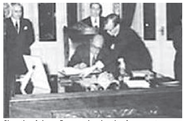
Close ties: A Japan-Paraguay Immigration Agreement was concluded in 1959.

challenges by virtue of their wisdom and esprit de corps. The Japanese people have shown us their incredible moral virtues, resilience and stoicism, and kept absolute calm during and after the massive earthquake with a complete absence of panic. As citizens rushed to purchase bottled water and supplies thinned amid news of potential radioactivity from the Fukushima nuclear plant, the price of bottled water remained stable in an incredible demon-