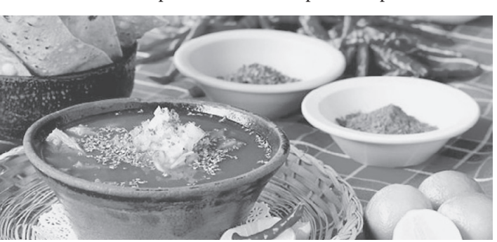
One-of-a-kind: Traditional Mexican cuisine is an Intangible Cultural Heritage of Humanity, as deemed by UNESCO. MEXICAN EMBASSY The time to visit Mexico is now

tary Friendship Federation shares the joy that Mexico experiences in another anniversary of its independence. We are committed to continue supporting the exchanges between both countries and to further strengthen the bilateral partnership.