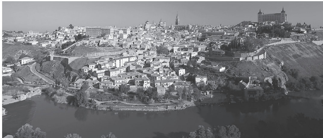
Monumental: Located in central Spain, Toledo is one of the former capitals of the Spanish Empire and has been a UNESCO World Heritage site since 1986.