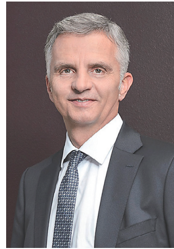
President Didier Burkhalter of the Swiss Confederation

This anniversary year is an auspicious opportunity to underscore the extent and strength of our relationship, and it will be marked in both countries with a series of outstanding events and a number of high-level political visits. In Japan, Swissdays, a multifaceted four-day event to be held in Roppongi Hills will officially launch the celebrations in the presence of H.E. Didier