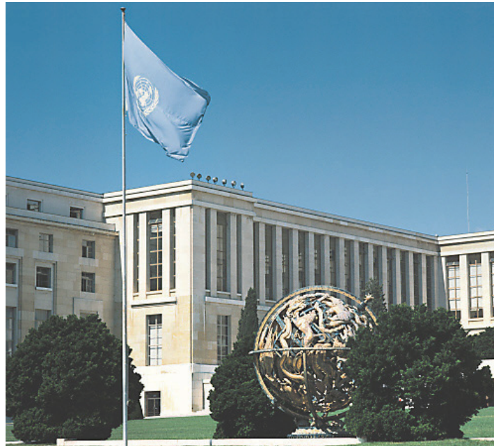
For peace: The Palais des Nations in Geneva, Switzerland is a symbol of the many international organizations that have their headquarters in the city.

ter and his wife, particularly this year, the 150th anniversary of the establishment of diplomatic relations between Japan and Switzerland, is expected to further deepen the friendly relationship between the two countries.