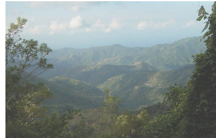
Coffee grown in the Blue Mountains in Jamaica is considered to be one of the finest and most sought-after varieties in the world.

In years past, Bob Marley was the singular Jamaican name which enjoyed univer-