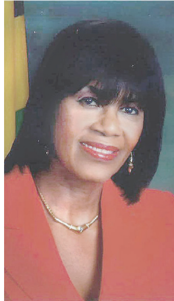
Jamaican Prime Minister the Most Hon. Portia Simpson Miller

While Jamaica moves forward with these plans, it has