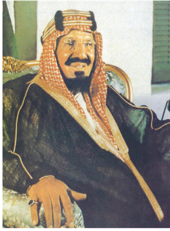
Founder of the Kingdom of Saudi Arabia, the late King Abdulaziz bin Abdulrahman Al Saud

Institutional and administrative modernization, development of regulations and facilitation of procedures have led to a significant improvement in the business environment and to the attractiveness of the kingdom for foreign direct investment. The volume of foreign direct investment increased markedly, so much so that the kingdom has come to be at the forefront in the Middle East in this regard.