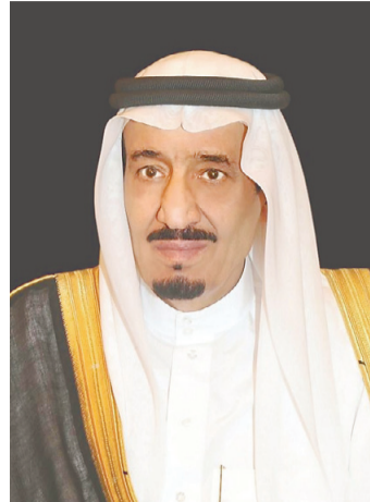
King Salman bin Abdulaziz Al Saud