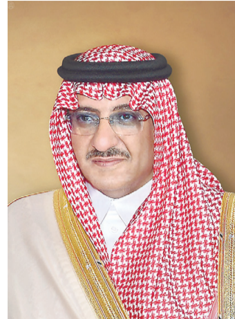
Crown Prince Muhammad bin Naif bin Abdulaziz Al Saud

Considering the Saudi citizen to be the focus and the ultimate goal of the development, the government of Saudi Arabia has accorded special importance to human resource development. As a result, education has grown remarkably to an unprecedented level. Similarly, higher education has achieved notable quantitative and qualitative progress. Concurrently, efforts have continued to develop programs, raise quality and intensify scientific and technological research at universities. Equally important are the advances being made in training. Similar achievements have also been made by the private sector.