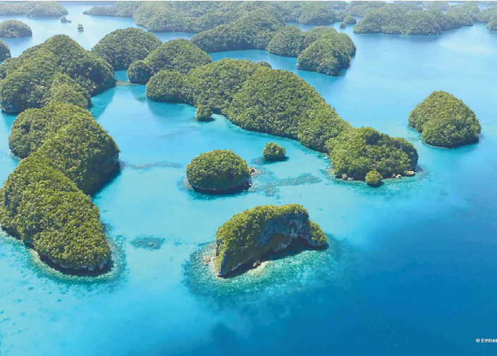
Clockwise from above left: Palau's famous Rock Islands; Enjoy the ultimate island style in Palau; K-B Bridge, or the Japan Palau Friendship Bridge, connects Koror and Babeldaob Islands. It is a reinforced concrete, cable-stayed bridge with a total length of 413 m.

As Palau continues its nation-building efforts, it does so assured of Japan's continued cooperation, friendship, people-to-people exchanges and goodwill. It is with these reflections that Palau greets the people of Japan, and extends best wishes on the oc-