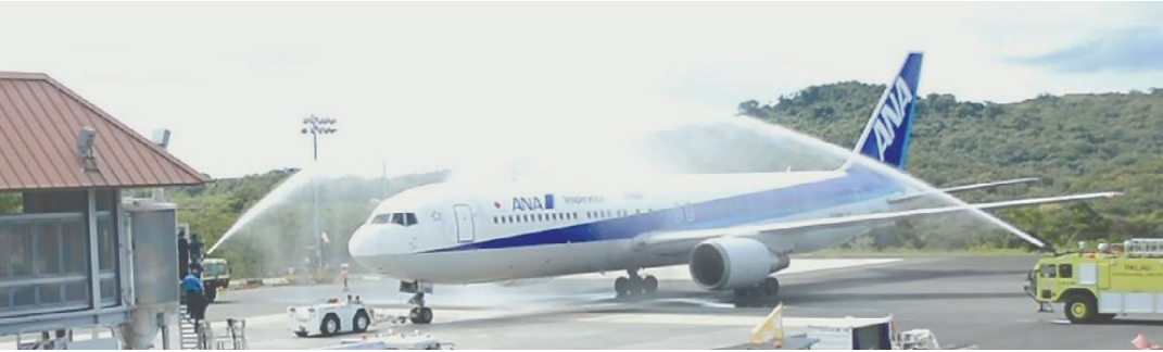
Top: UNESCO World Heritage site Rock Islands Southern Lagoon; Above: All Nippon Airways maiden charter flight on its arrival at Palau International Airport greeted by a water arch salute.