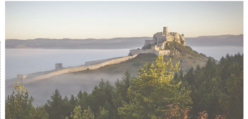
Spis Castle in eastern Slovakia was built in the 12th century. This is one of the largest castles by area in Europe. EMBASSY OF SLOVAKIA

This content was compiled in collaboration with the embassy. The views expressed here do not necessarily reflect those of the newspaper.