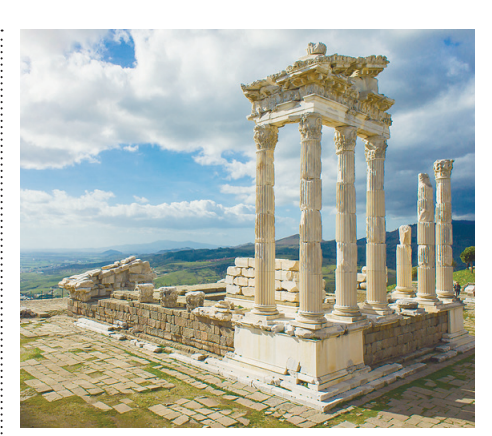
The Temple of Trajan in Pergamon dates back nearly 2,000 years.

While Turkey's long stretches of coastline offer a range of opportunities to see the natural beauty of the country, the Mediterranean has scuba diving at Kas, with more than 40 dive sites within range of the city's Old Harbor. The clear water