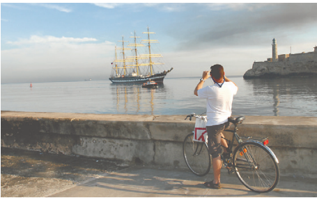
A cyclist stops to take a photo of a ship along the Havana waterfront; Below: Cuba's biotech industry is key to its impressive efforts to halt the pandemic.

This content was compiled in collaboration with the embassy. The views expressed here do not necessarily reflect those of the newspaper.