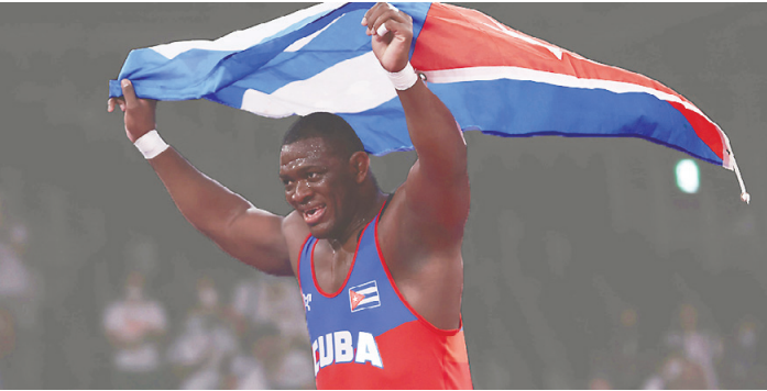
Top: A street in Old Havana with a view of the Minor Basilica of Saint Francis of Assisi; Above: Mijain Lopez achieved the historic record of four gold medals in a row in Greco-Roman wrestling at the 2020 Tokyo Olympics.