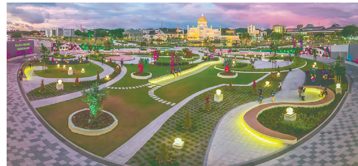
Bandar Seri Begawan is home to the Taman Mahkota Jubli Emas water-front park.

This content was compiled in collaboration with the embassy. The views expressed here do not necessarily reflect those of the newspaper.