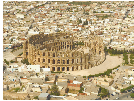
Left: The El Jem Amphitheater, built around 238, was designated a UNESCO World Heritage Site in 1979. Right: The Avenue Habib Bourguiba Clocktower stands in Tunis, which will host the eighth Tokyo International Conference on African Development.

Tunisia is keen to make this event a successful physical gathering. A presidential decree on the organization of TICAD 8 has been issued to establish a National Organiz-