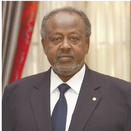
President Ismail Omar Guelleh EMBASSY OF DJIBOUTI

on African Development, which will convene for the eighth time later this year at TICAD 8, remains for us the platform of choice for discussing current topics of common interest.