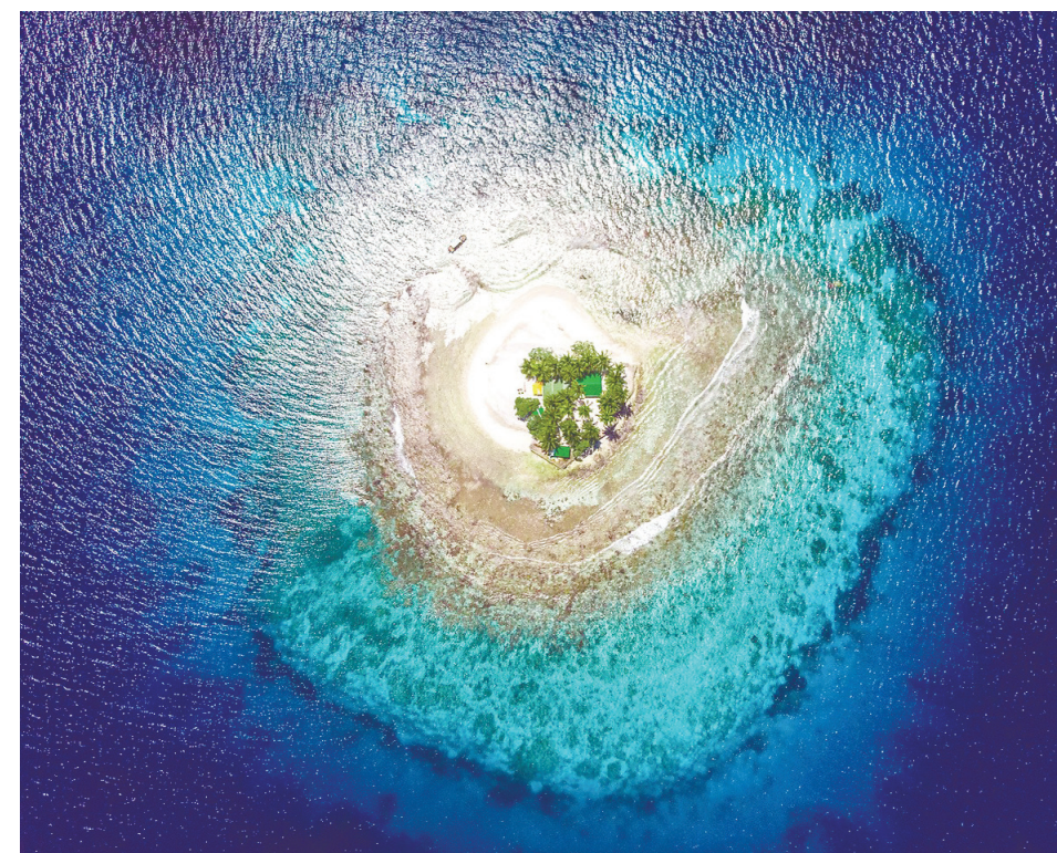
Jeep is a tiny uninhabited island that was once ranked No. 1 in Fuji Television's program on the 100 most beautiful views in the world.

The new building is a great accomplishment and I look forward to more fruitful outcomes from this area. We sincerely look forward to seeing the Federated States of Micronesia developing and prospering in this respect. Our association remains committed to further enhancing our relationship.