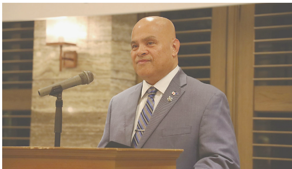
President David Panuelo EMBASSY OF MICRONESIA

The people and government of the Federated States of Micronesia take pride in their historic and traditional link with the people of Japan that goes back more than a century. We sincerely welcome the opportunity to strengthen and enhance the friendly relations that our people have come to enjoy over the years. It is my belief that a relationship based on mutual understanding and true friendship will be a lasting one that our people can benefit from and be proud of.