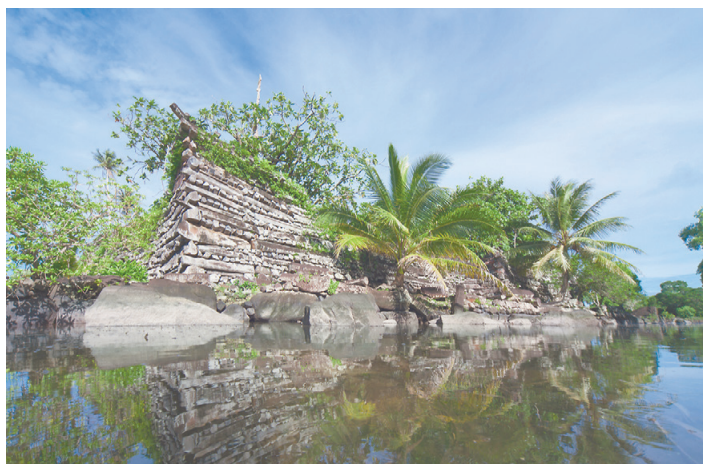
Above: Declared a UNESCO World Heritage Site in 2016, Nan Madol is the only ancient city built on a coral reef and the largest megalithic site in the Pacific region, consisting of around 100 man-made islets linked together in a lagoon. Below: Rai stones on Yap Island

This content was compiled in collaboration with the embassy. The views expressed here do not necessarily reflect those of the newspaper.