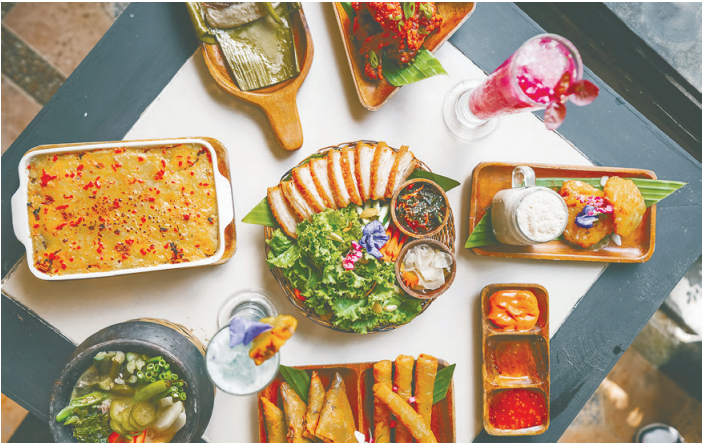
Siglo Modern Filipino serves up a spread in Cavite, Cavite province.