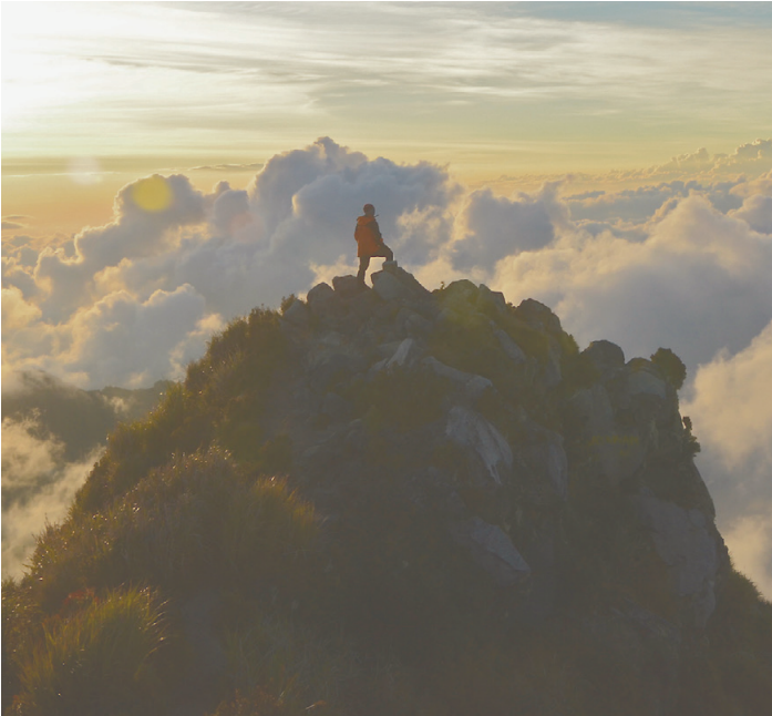
Left: Dancers perform at the annual MassKara festival in Bacolod, Negros Occidental province. Right: A climber takes in the sights from the summit of 2,954-meter Mount Apo, the highest mountain in the Philippines. TOURISM PHILIPPINES