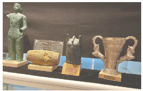
Objects on display at Beautiful Iran, a permanent exhibition at the Iranian Embassy.

This content was compiled in collaboration with the embassy. The views expressed here do not necessarily reflect those of the newspaper.