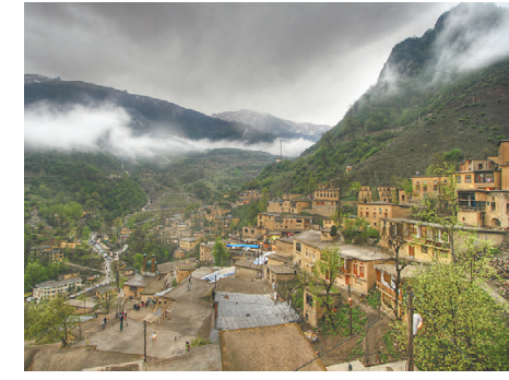
The uniquely built village of Masuleh dates back to the 10th century.