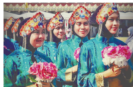
Bruneian people in traditional dress EMBASSY OF BRUNEI DARUSSALAM

I hope these joyous events mark a fresh start to bilateral exchanges between our countries and provide a boost for further development in our relations, which remained conservative due to the pandemic over the past few years. As has been the case in the past, the JBFA will further continue to render utmost support to maintain and strengthen the excellent ties between us with these tailwinds.