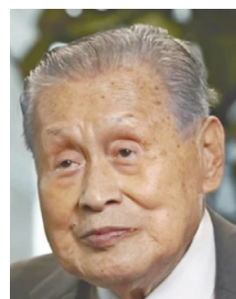
YOSHIRO MORI FORMER PRIME MINISTER OF JAPAN

On the occasion of the 67th anniversary of the independence of the Republic of Tunisia, it gives me a great pleasure to extend my warmest congratulations and best wishes to the people and govern-