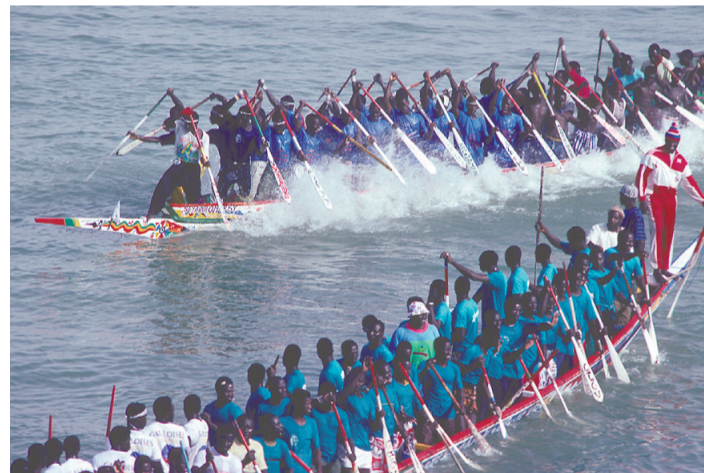
Left: Dakar is Senegal's largest city. Right: Pirogue crews race during the annual St. Louis regatta.