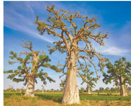
Baobab trees are the symbol of Senegal and known as good sources of nutrition.

One of the highlights of this visit was the meeting between the president and His Majesty Emperor Naruhito, in which they mainly addressed their shared commitment to issues related to water access